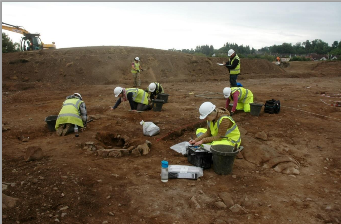
Excavation of archaeological features at Maidenhill.

ARO46: A well-trodden path: the prehistoric landscape of Maidenhill, Newton Mearns, East Renfrewshire by Maureen C. Kilpatrick is freely available to download from the ARO website - Archaeology Reports Online .