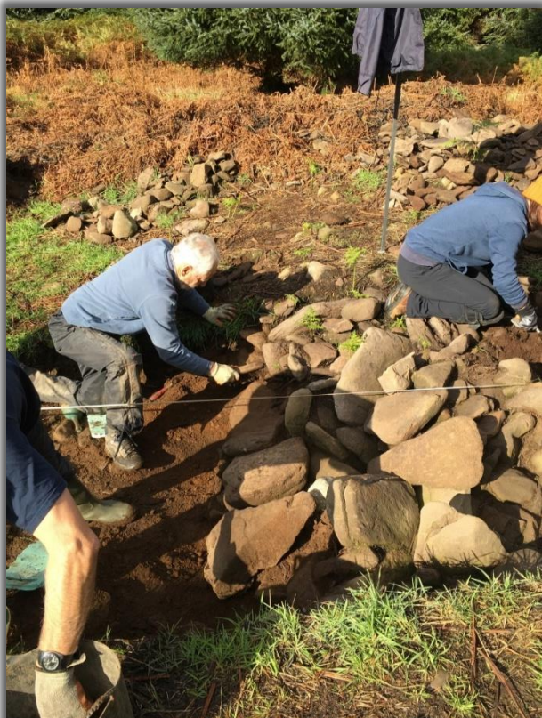
The cleaning of the Iron Age bank/wall.

We are currently in our third month of slow but steady excavation, a day a week, but without deadlines or backfilling (yet) we have the time and space to fully explore the structure. We are digging a series of staggered trenches amounting to 2m by 20m. We have a team of between 5 and 20 people who come when they can. The vegetable plot within the Iron Age structure appears to contain another longhouse. We have finally hit Iron Age material and are recording the collapse of the substantial wall which appears to show slumped coursing, with that familiar stacking of edge set stones. Our aim is to completely remove the wall to look for core material and pre-structure deposits...wish us luck!