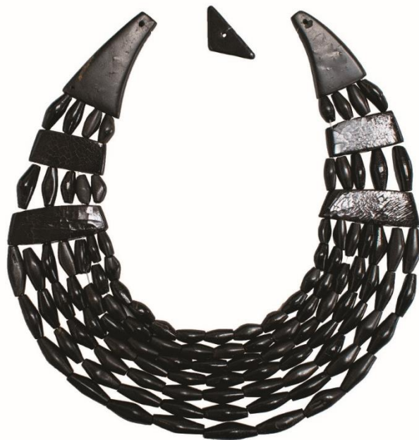
Dunragit Jet necklace after conservation

Part of the new bypass extended across a gravel ridge, the remnants of a raised beach with views across the lower-lying former estuary and Luce Bay further south. Along this