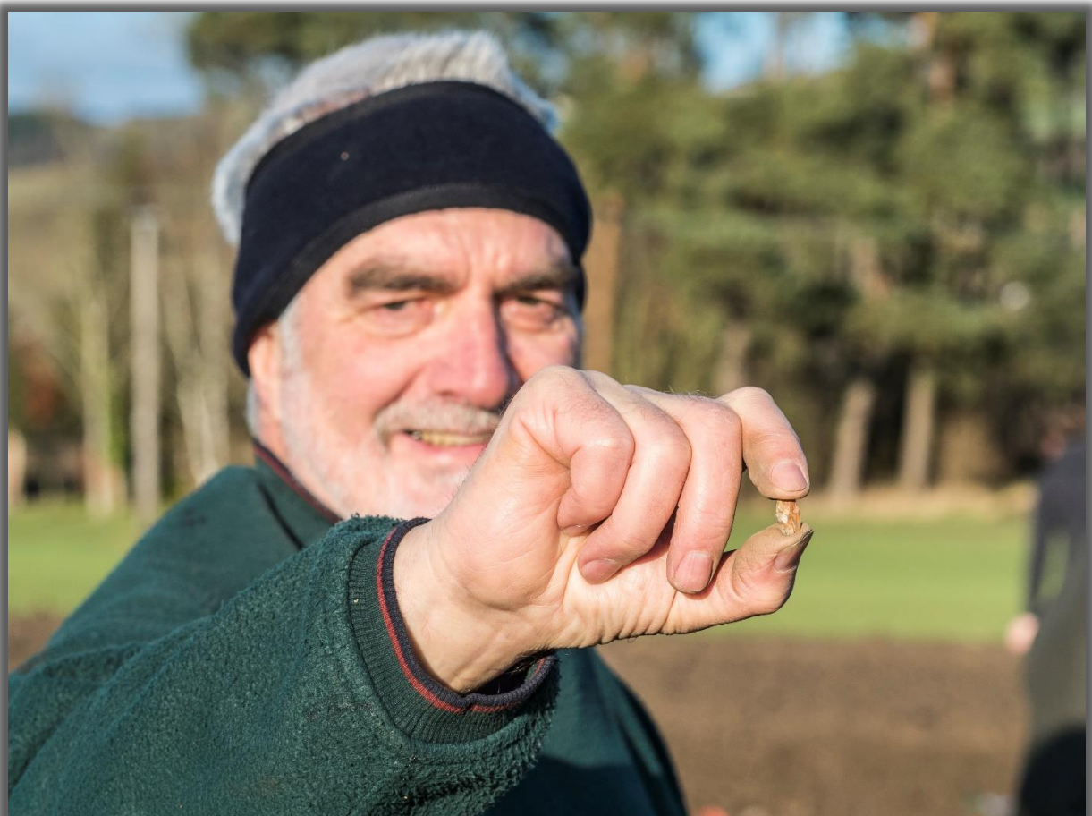
A Carnelian flake found by a volunteer during fieldwalking at Freeland Farm, Perth and Kinross. Tay Landscape Partnership

Now in its final stages, work on the Perth and Kinross Archaeological Research Framework is progressing at pace with drafts of chronological period chapters being prepared for public consultation. We are delighted to announce the Late Upper Palaeolithic/Mesolithic and Neolithic chapters have entered the final phase of production and drafts are now available to download and review from the PKARF website . Further prehistoric chapters will be available in the coming weeks – watch this space!