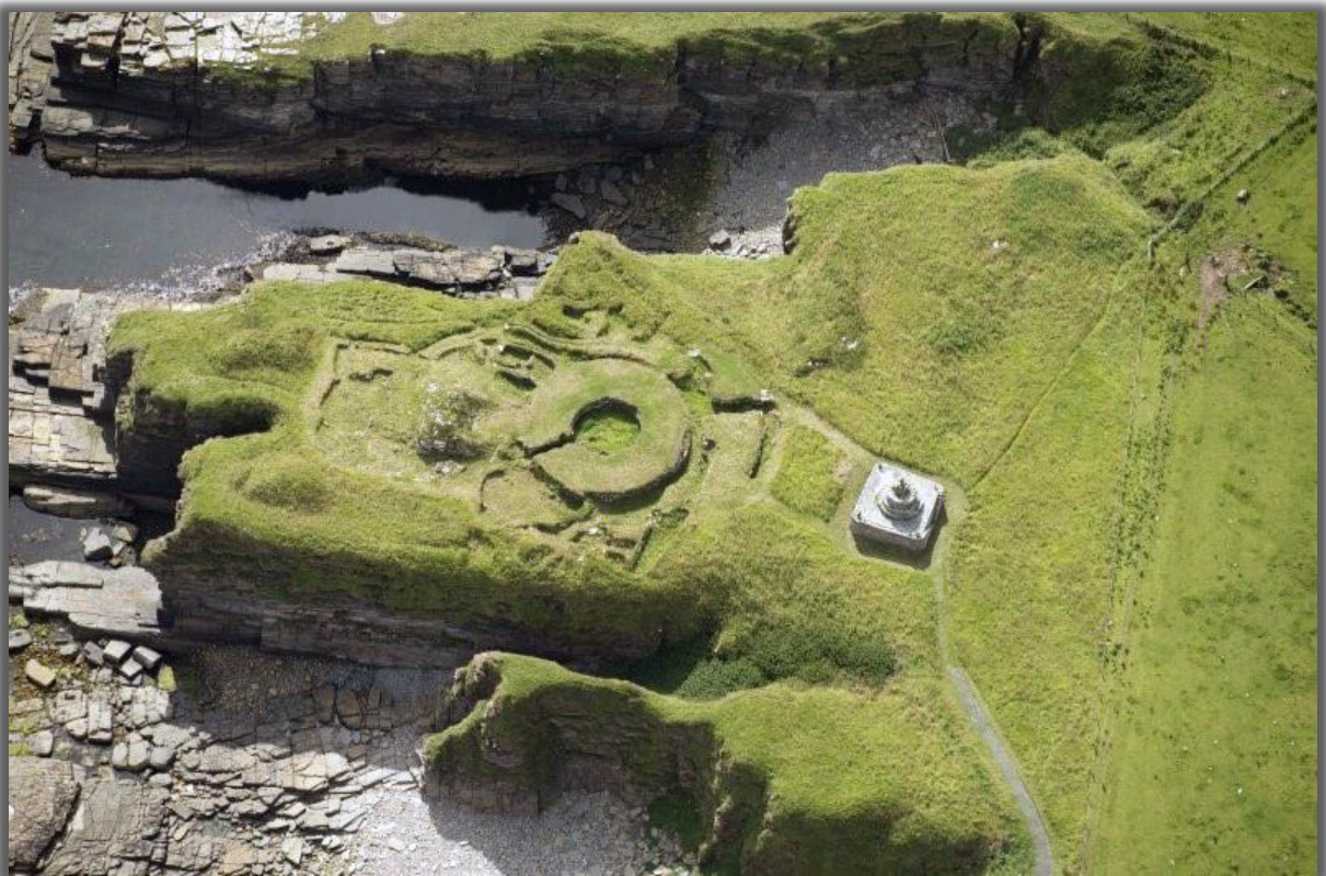
Aerial view of Nybster Broch – discussed in a new HighARF Case Study.