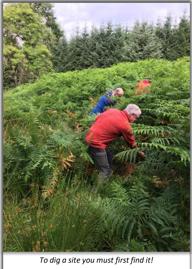
To dig a site you must first find it!

Callander was lucky enough to be the recipient of Landscape Partnership funding from the National Lottery Heritage Fund to undertake archaeological training and research. The funding was deliberately structured to escalate the training from survey to excavation with ever smaller degrees of supervision. Within six months of the scheme's completion there was a slight underspend of less than £500. How might this money be spent? If a team of contractors were employed to do a dig this might buy a few days of post-excavation. If, however, the money was used to support post-excavation and the