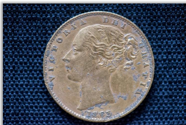
Gold sovereign

Amongst the assemblage of bottle glass and glazed ceramic fragments dating mainly in the eighteenth and nineteenth centuries, a half gold sovereign, minted in London in 1863, was also recovered from the site. At 22 carat gold the value of such a coin was significant and was a considerable loss to the owner. The coin was probably lost through the spread of night soil across the fields for fertilisation at some point during the late nineteenth century.