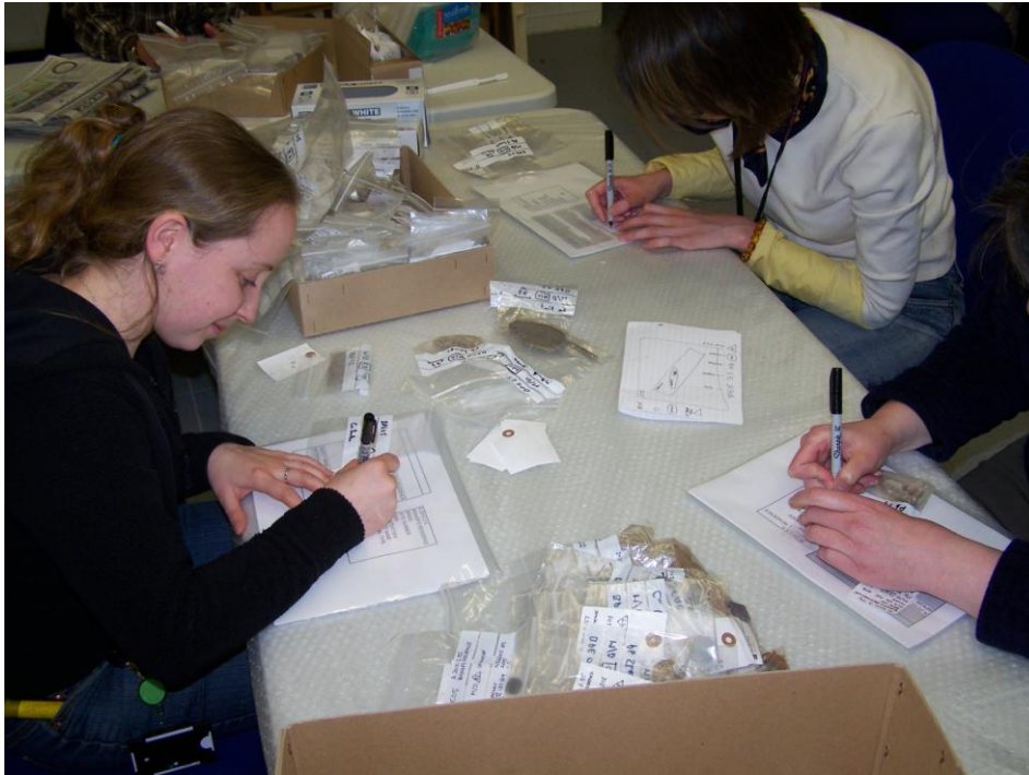
Processing and repacking the objects

We also offer space and facilities for researchers to access our holdings and we hold 'Archaeology Uncovered' workshops for children aged between 7 -14 to come and access the collection and have a go at their own experimental archaeology.