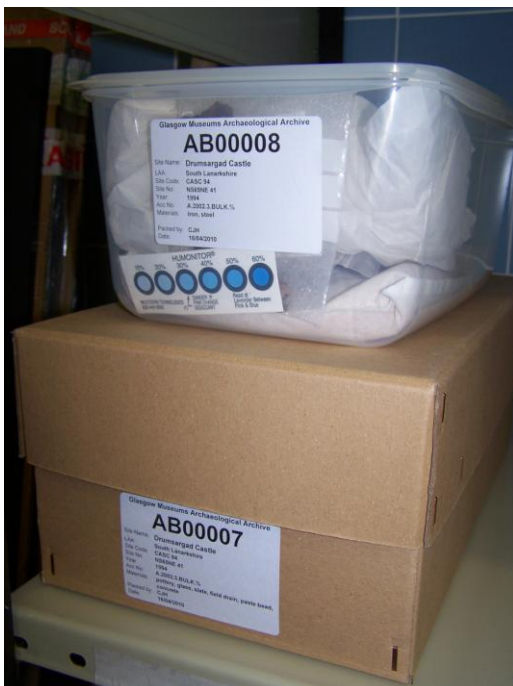
Our repacked and standardised system for storage