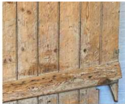
↑ Scrape mark evidence of stereotyped behaviours on stall partition from Rufford Abbey

Research and archaeological investigation of these country house stables has revealed more about how they functioned and how they were experienced. Stables functioned as buildings of confinement and despite some being designed to aid good physical health, they also had the potential to adversely affect horses' mental wellbeing. The combination of confinement and a diet of high-energy grain caused horses to perform stereotypic behaviours, repetitive movements that relieved the stress of confinement and simulated natural grazing patterns. Historic stables are revealing evidence of these behaviours scratched into their fabric. These 'masonry message boards' onto which these players etched their feelings can fill the gaps in documentary evidence. In stables this 'equine graffiti' attests to how horses experienced these spaces. Until now such marks have only been recorded on timber stall partitions as at Rufford Abbey, but investigation at Park Hall stables revealed the first recorded example of historic equine graffiti to a masonry wall. Salvaging this evidence through detailed recording of internal spaces is necessary to reveal a more nuanced understanding of how horses experienced historic stables.