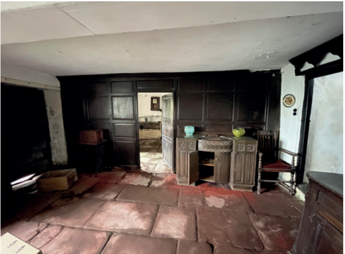
Kitchen parlour

The large 18th-century threshing barn and combination barn also demonstrate the prosperity of the farm and the importance of mixed agriculture in an area that, since the late 19th-century, has been best-known for its pastoral landscape grazed by sheep and cattle. In the 18th-century barns, timber stall partitions and a manger are still in place in the cattle housing. Unusually, there is still a stone-flagged threshing floor. This is so often replaced by a more practical concrete screed. Substantial numbers of roof timbers and trusses are still in good order across the site. With reference to Historic England's Farmstead and Landscape Statement for the High Fells ( https://historicengland.org.uk/research/current/discover-and-understand/rural-heritage/farmsteads-character/ ), it is clear that the whole group is outstanding for its evidential interest, the way that it illustrates how farming developed in the Lake District and also for the architectural and aesthetic interest of its fabric and detail.