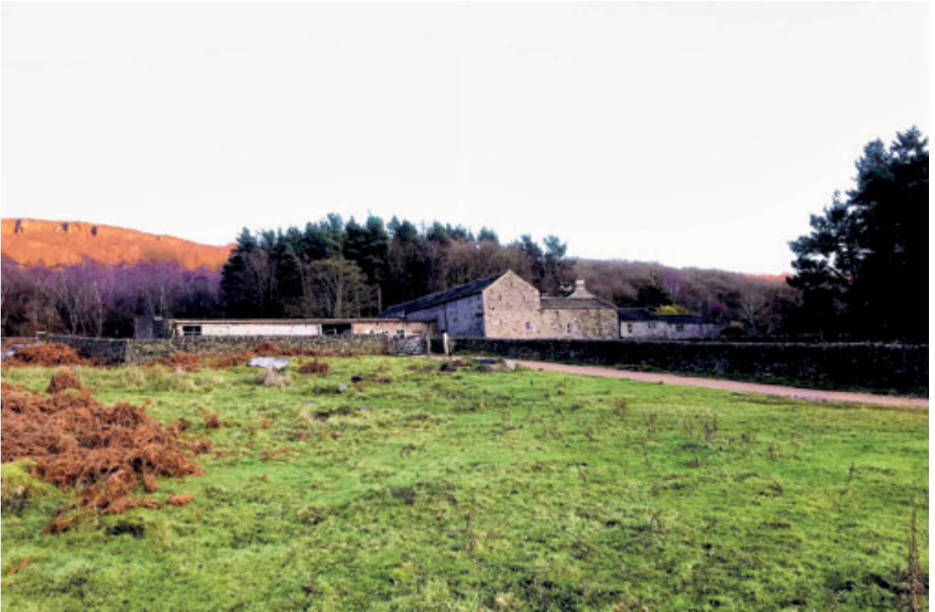
View of the farmstead from the west, showing the fragments of the early 20th-century shelter shed which has been retained as part of the scheme, and the main L-plan range to the right of the image.

In addition to preparing illustrated and written records to different levels of specification, accredited buildings archaeologists are also well-placed to deliver high-level and strategic assessments of buildings in their landscape and historic context. In this instance, the National Trust has commissioned a rapid assessment of the historic character, significance and potential for change of its traditional farm buildings in the Peak District to inform options for adaptive reuse following Historic England's advice on this.