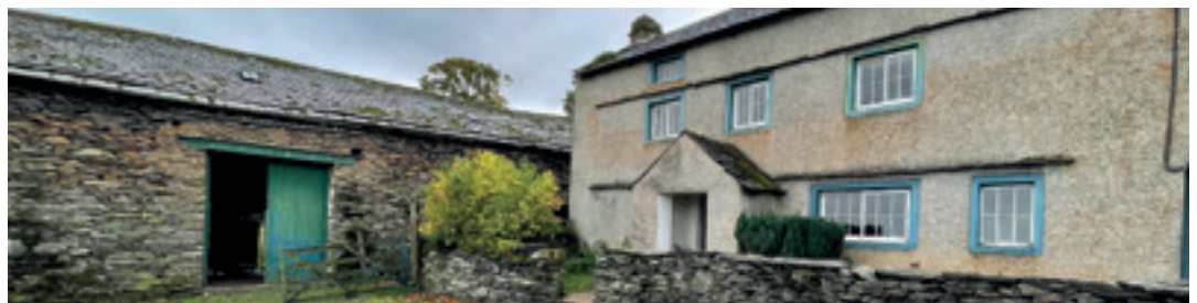
Eastward Farmhouse and attached barns, The Lake District