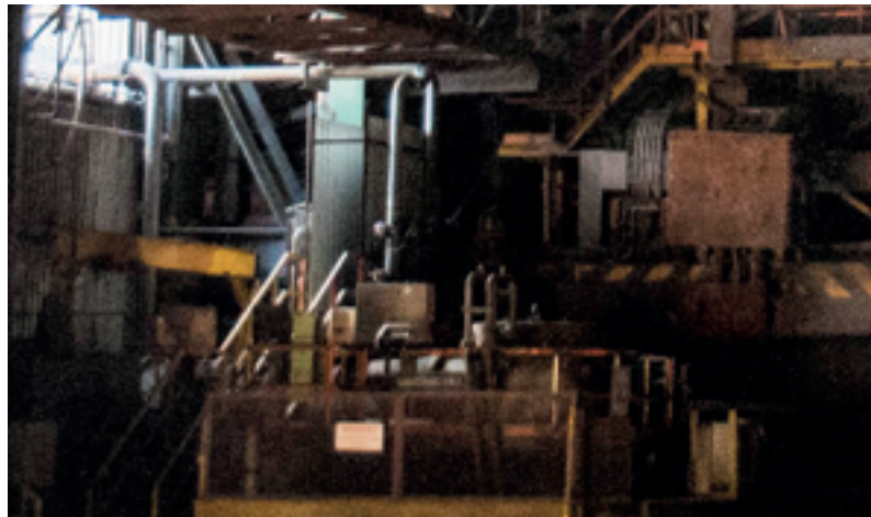
Interior view

A particular challenge to photographic recording was the restricted access to parts of the site and interior of some of the buildings. The internal spaces were often large and poorly lit; flash photography was of relatively little use in lighting these spaces. The limited fieldwork time and strict recording schedule also restricted the use of long tripod exposures, requiring a balance between rapid data capture and image quality. Because of safety concerns and limited access, it was not possible to use tripods in certain areas and hand-held photography was the only option. The use of high-quality cameras with high ISO and recording in RAW helped to provide the best possible images in these conditions.