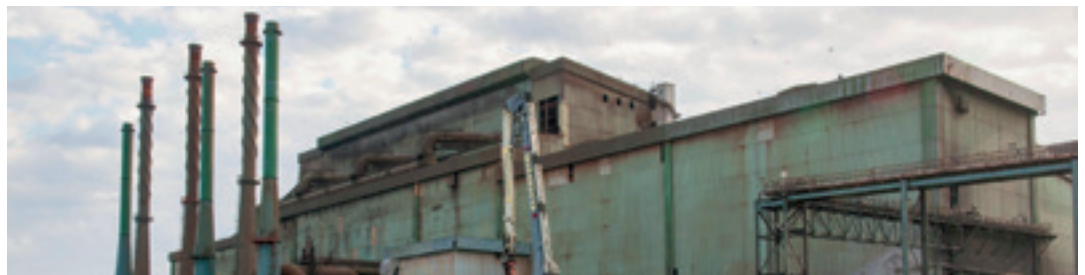
Teesworks industrial zone

We hope that the following case studies illustrate some of the contributions brought by an archaeological approach to understanding buildings and inspire those who are responsible for finding new uses for old structures to seek advice and support from a ClfA-accredited professional.