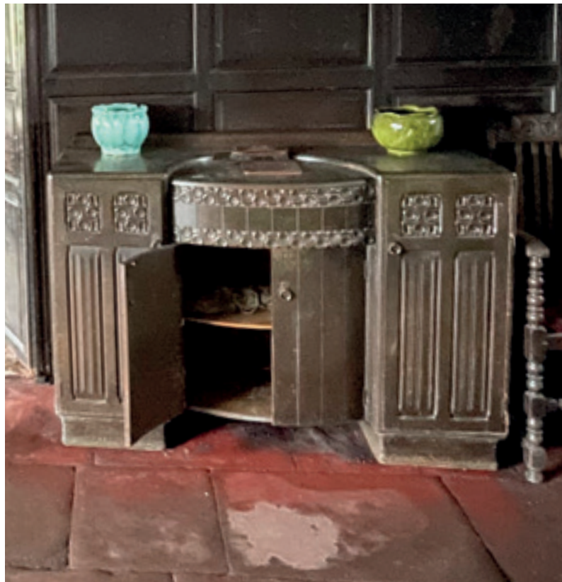
Interior view

Historic England has since carried out a full inspection and the Secretary of State has decided to amend Eastward Farm’s designation to Grade II*. This will ensure that works to upgrade the site will be proportionate to its outstanding historical and archaeological interest. The CBA’s hope is that a Level 4 Building Recording of the site (see Understanding Historic Buildings: A Guide to Good Recording Practice , Historic England, 2009) will inform a revised scheme that retains more of the extant fabric and character as a proportionate response to Eastward Farm’s significance and potential for sensitive adaptation