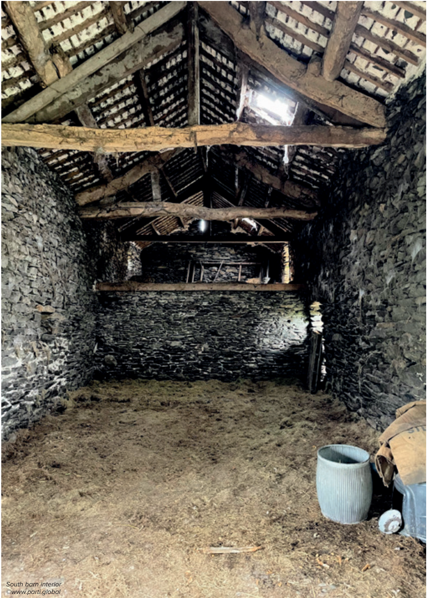
South barn interior