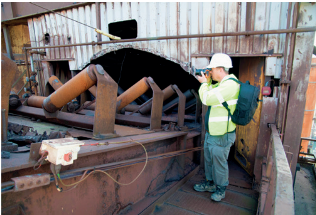
Blast furnace charging conveyor

A highlight of the site and recording project was the blast furnace, which was prioritised early in the recording schedule because of its heritage significance and the level of detail required. Built in 1979, the uppermost plant was almost the same height as the top of St Pauls Cathedral, rising to approximately 104m. The blast furnace was the focal point in the flow of materials around the Redcar site and its primary purpose was to produce molten iron to a specific tonnage and quality as required at the steel plant. Although at first glance often taken as comprising the upstanding furnace, the blast furnace facility actually contains a wider sprawl of associated infrastructure including gas and dust collection, cleaning and processing, conveyors and charger, slag and waste material processing, as well as the gas, air and water required to drive the process. At the height of operation, the furnace provided the continuous production of iron at a capacity of 63,000 tonnes per week. The team was fortunate to be able to gain access into the blast furnace facility and was able to record the principal elements from inside the structure and from the multitude of working platforms.