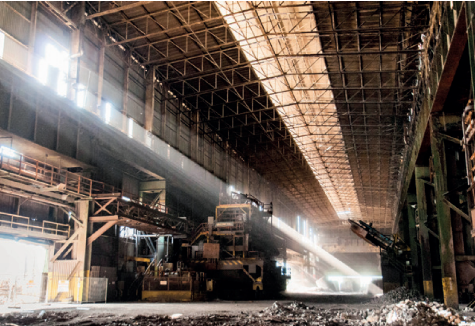
BOS Plant Teeming Bay, showing a de-gasser unit