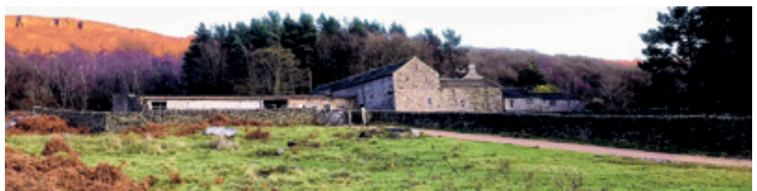
A strategic approach to adaptive reuse