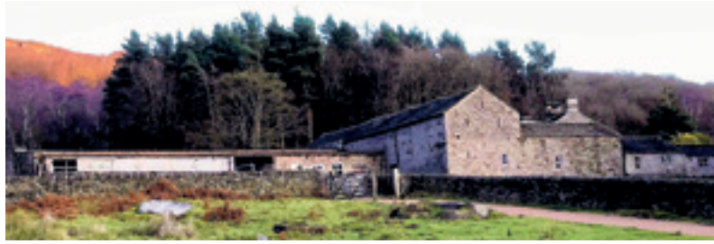
Exterior view