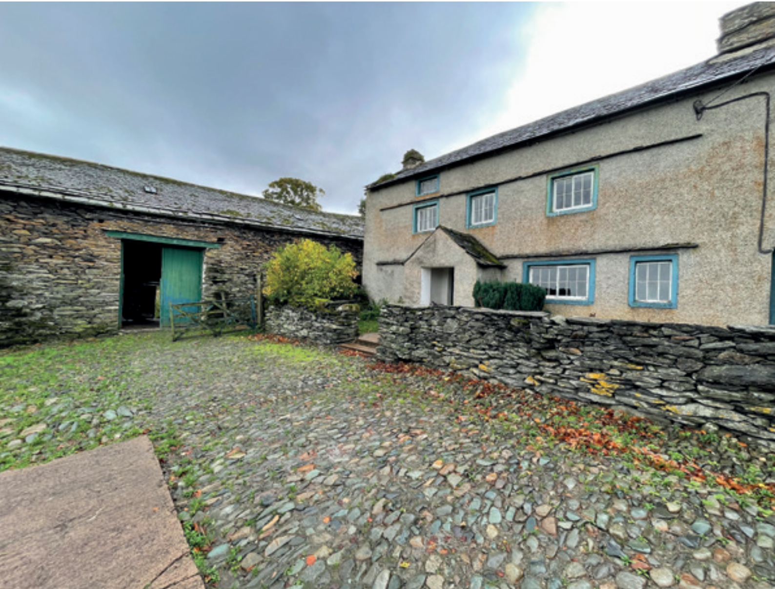
Front elevation of the farmhouse, with the south barn to the left