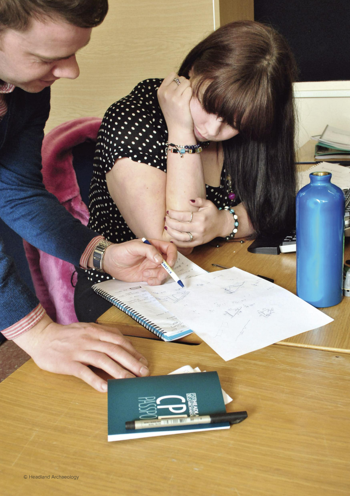
Table 5 The Learning Agreement