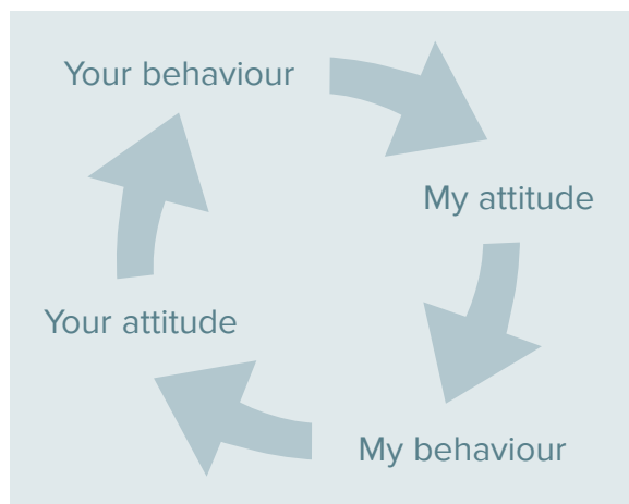
Betari Box cycle

It's also worth considering the simple Betari Box cycle, which shows how our attitude and behaviours can affect and influence the attitudes and behaviours of those around us.