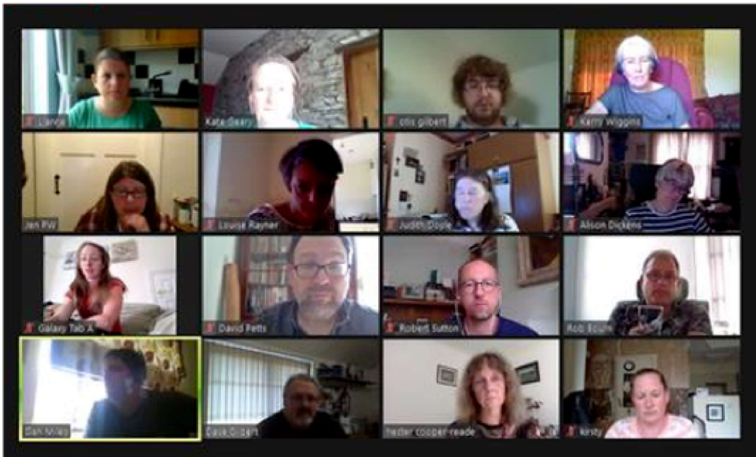
First Zoom meeting of the Professional Standards Advisory Panel.

The aim of the review is to look in more detail at the structure, format, and content of the Standards and guidance and their relationship to the Code of conduct . Redesigning them as a digital resource will be explored to facilitate wider use and better cross-referencing with other resources and good practice examples. This resulting suite of Standards and guidance will ensure that the information presented is: