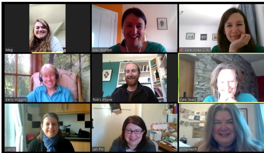
10am catch up.

Right now you're likely to be studying remotely and wondering when you're going to be able to return to university or your training position. Or you may be thinking about how you're able to get a job when a good part of the world is in lockdown.