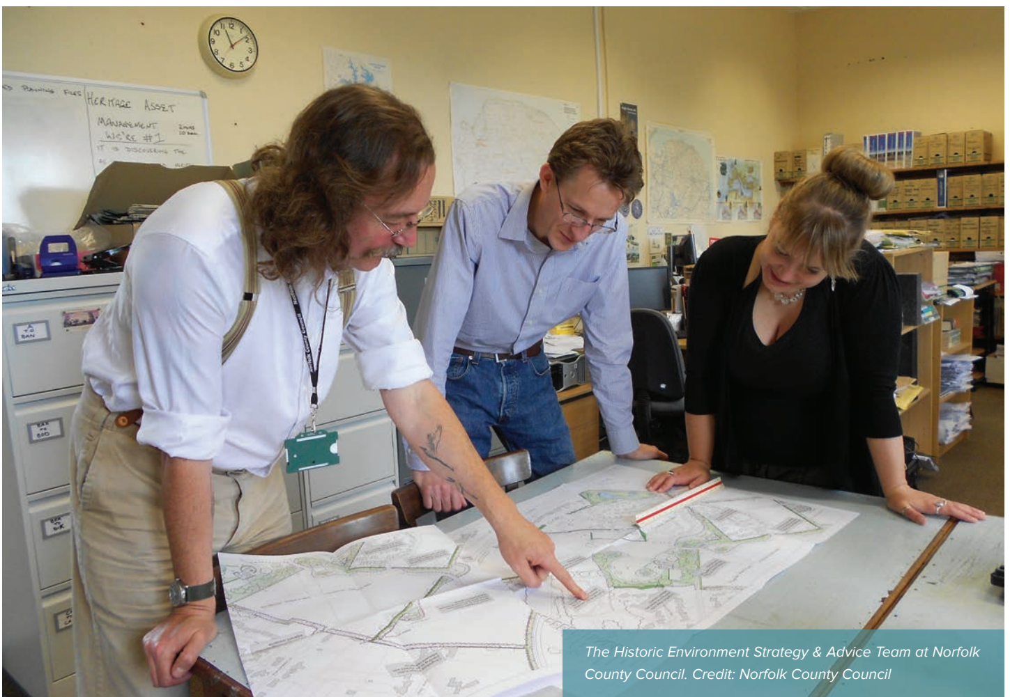
The Historic Environment Strategy & Advice Team at Norfolk County Council.