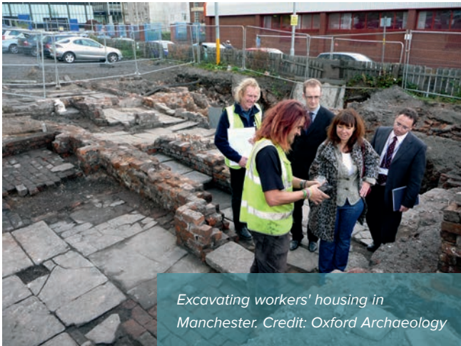
Excavating workers' housing in Manchester.