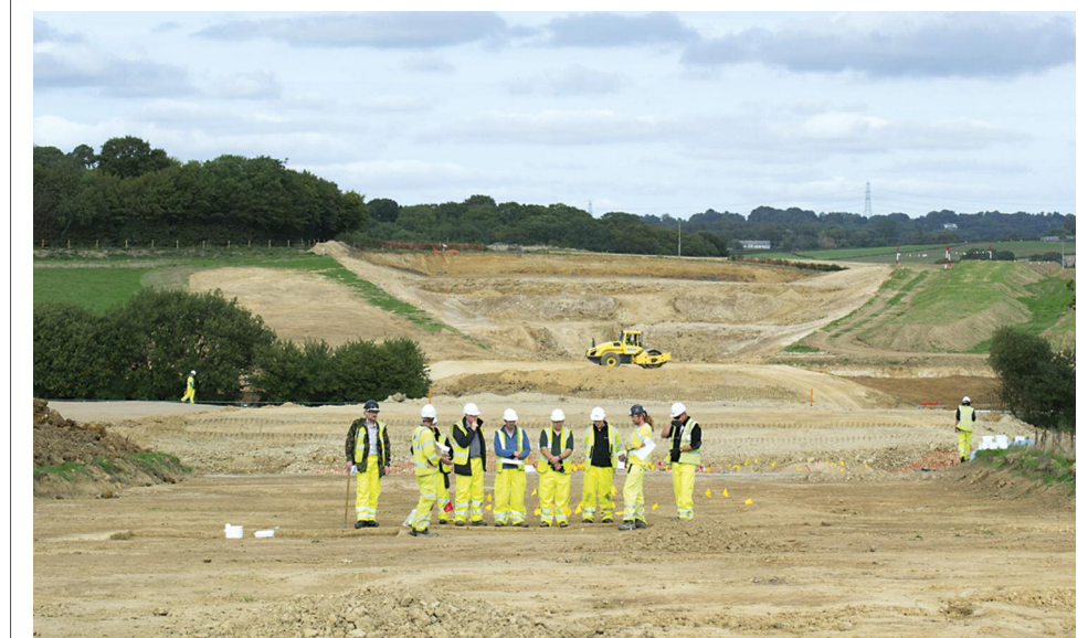
To ensure best practice and disseminate information an Oxford Archaeology Project Officer on the Bexhill to Hastings Link Road Scheme discusses methodological approaches and the latest discoveries with a group of visiting prehistoric/flint specialists from other professional organisations.