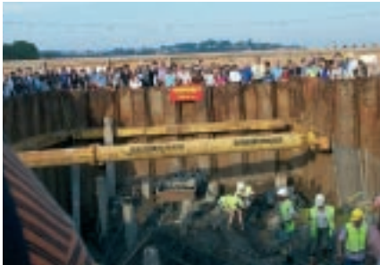
The Newport Ship Open Day demonstrated huge public support for archaeology.

The provision of advice to Tir Gofal highlights the central role played by the SMRs created and maintained by the trusts. Our 130,000-plus entries underpin many of the monument-based surveys undertaken on behalf of Cadw. The SMRs are also used by all of the unitary authorities in Wales on a daily basis and in one way or another they also inform the work of the Forestry Commission, the Environment Agency and by many other public and private bodies and individuals throughout Wales. The trusts have always ensured full public access to SMRs and are actively exploring greater accessibility through the internet. SMRs have already made a significant contribution to the Extended National Database for Wales, helping to share data and to make it available through an index (CARN) on the RCAHMW website. However, they still suffer from a chronic under-funding. Funding – for less than one full-time post in each of the trusts – does not recognise the full value of the SMRs as management tools, let alone allow their full educational and outreach potential to be realised. There will need to be a significant increase in financial support if the trusts are to fulfil their ambition of achieving the benchmark criteria for fully developed Historic Environment Records.