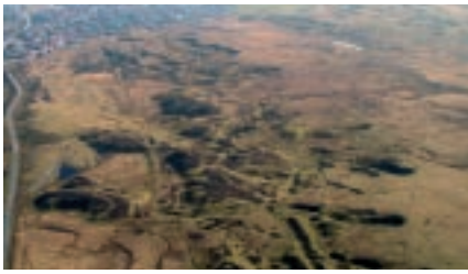
Merthyr Tydfil is another landscape of Outstanding Historic Interest. This extractive landscape results from the supply to the Cyfarthfa Ironworks.