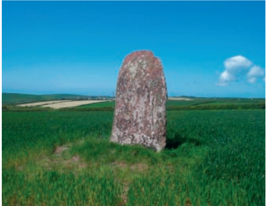
A standing stone with a very small plough margin. The intention is to increase this margin through the Tir Gofal Agri-environment scheme.

In general, the trusts warmly welcome the Review of the Historic Environment in Wales which recognises the major contribution that the historic environment makes to the cultural, economic and social well being of Wales. It specifically highlights the rich industrial heritage of urban Wales, and clearly more needs to be done to safeguard these eighteenth, nineteenth and twentieth-century landscapes that form the backdrop to the daily lives of much of the population. The focus should not simply be on protecting the core remains of the industrial works, but also the associated infrastructure, the evidence of extractive supply and characteristic local housing. Wales has taken a lead in promoting studies in landscape characterisation in both urban and rural contexts that look