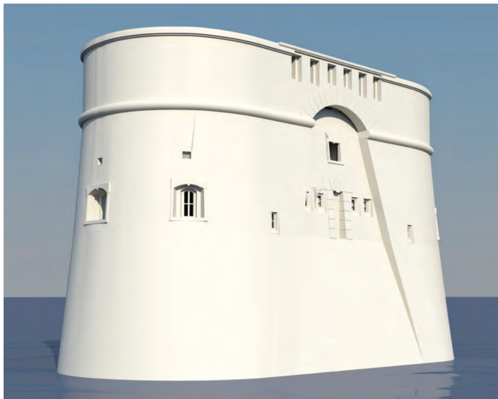
Digital 3D reconstruction of the North West Cambridge Gun Tower at Pembroke Historic Dockyard.