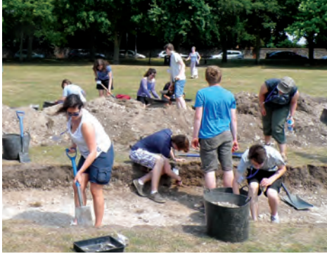
Sixth-form students from two state schools around Saffron Walden in Essex begin their excavation looking for the lost ditch and castle.

In this project, researchers from the University of Cambridge provided advice, training and support to 27 community groups in running their own community heritage project. Groups ranged widely in their interests, including local historical societies, church groups, traveller communities, schools, football clubs, women's groups and military regiments. The Cambridge Community Heritage team consulted with each group to identify their needs and provided training in aspects of archaeology, local history, archives, oral history and writing for publication, followed by tailored support for a wide range of community heritage project activities including archaeological excavation and field-walking, recording personal memories, theatrical performances, and even knitting. As well as responding to the needs of diverse communities, the project has generated a wide range of new data for research and archive material across a range of heritage-related disciplines.