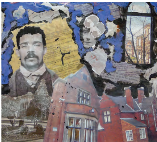
'Asylum Heritage Montage' by an ArtSpace participant.

Leicester and Leicestershire Irish Forum