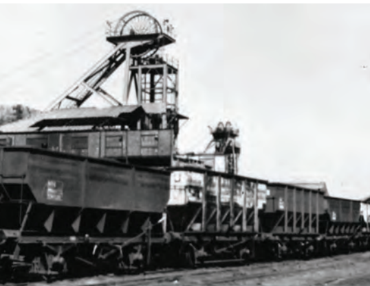
Industrial railway scene, Tyneside.

Research for Community Heritage Phase Two – Follow-up Funding NE England Andrew Newman