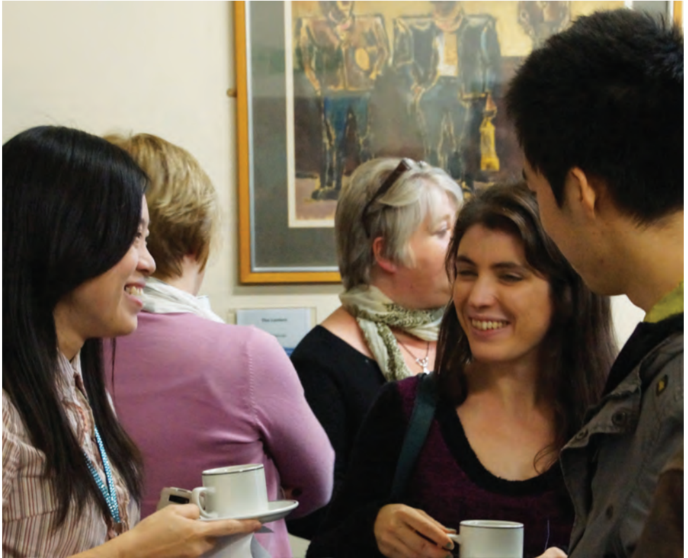
Clydach Heritage Centre group at community workshop led by Swansea University.