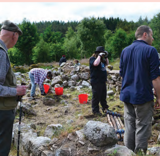
Community Volunteers and Project Staff at Bennachie Landscapes Project.