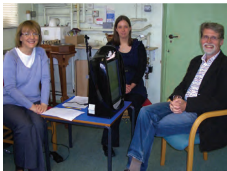
Partners in History: interviewing with University of Hertfordshire video booth at St Julian’s Church Hall, Sopwell May 2013.