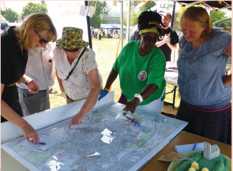
The CAER project roadshow at Ely Festival where local residents of all ages offered the HEART of Cardiff team advice on routes, important way-marks and local stories.

around the Ely and Caerau district connecting the Caerau hillfort site and the nearby National History Museum at St Fagans. Digging Caerau and HEART of Cardiff have also run in synergy with Action Caerau & Ely's All Our Stories HLF Funded Pathway to the Past which has involved local young people and residents in the creation of a heritage trail across Caerau Iron Age hillfort.