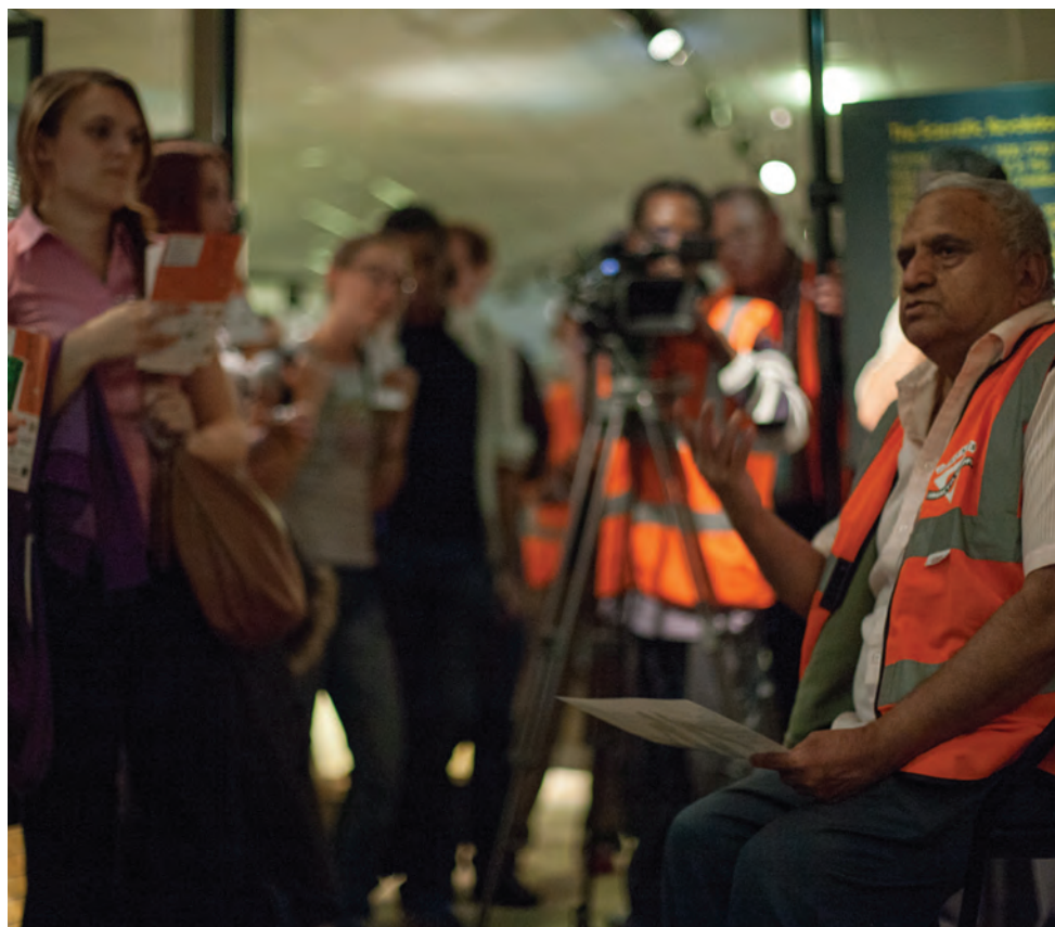
CoolTan Arts 'Shuffle talk' at Science Museum, July 31st 2013.