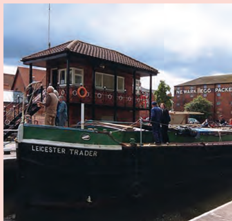
The Leicester Trader.

The Newark Heritage Barge CIO Project Manager