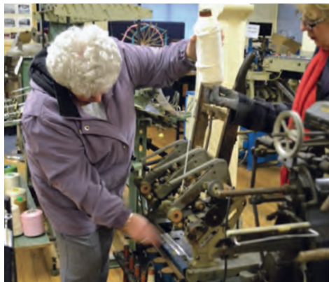
Oral History and Schools Workshops, Paisley, April 2013.