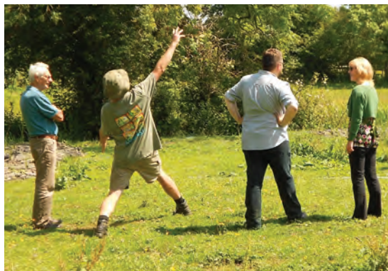
Geographic Survey with community partners at Barrow on Trent.