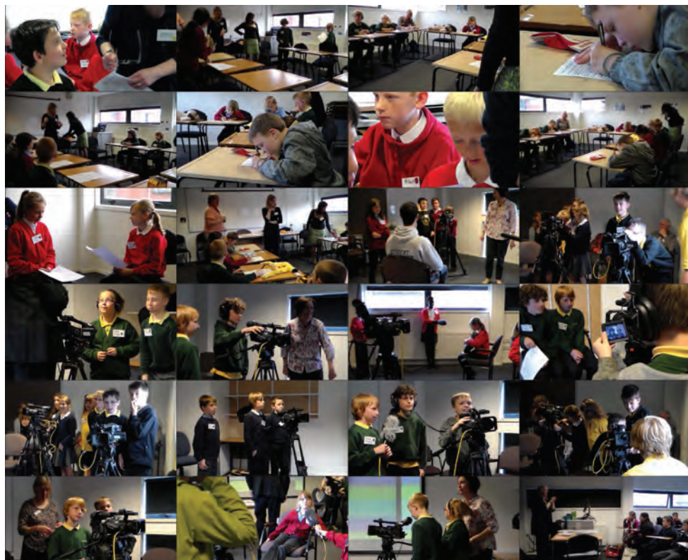
Spalding schools' workshop day at the University of Lincoln.

able to learn about untold local histories, community cohesion and the ways in which different communities relate to each other over time.