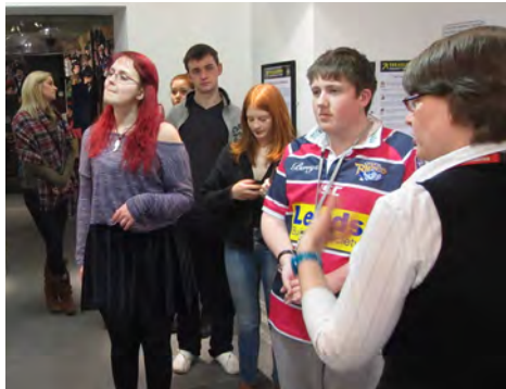
The Sound Craft Vision Place Open Day Event at Huddersfield in June 2012.

The Heritage and Stigma project is designed to link academic understanding of the histories of mental health and learning disability with areas of current practice, and raise awareness and understanding of issues in the present and past. With the follow-up funding, the team have been able to offer advice and support as research professionals in order to ensure the successful delivery of All Our Stories projects. The Mental Health and Learning Disabilities team worked alongside Leeds Mencap, St Anne’s Community Services and South West Yorkshire Partnership NHS Foundation Trust, resulting in an exhibition, online materials and publications, as well as the creation of new archival resource.