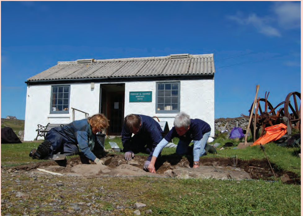
Members of the Colonsay and Oronsay Heritage Trust excavating the foundations of a 19th-century fisher cottage that underlies their visitor centre on Colonsay.

Member of Colonsay and Oronsay Heritage Trust