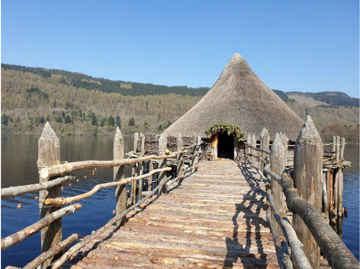
Friends of the Crannog

Centre is built has reached capacity and is unsuitable for the progressive plans the Crannog Centre has for future projects. The area, called Dalerb, is roughly 12 times larger than the current museum and will help to ensure that we as an organisation can continue to work towards our mission, caring for and making accessible the find of Scottish crannog excavations for the benefit and enjoyment of everyone.