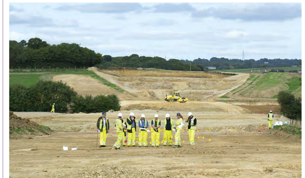
To ensure best practice and disseminate information an Oxford Archaeology Project Officer on the Bexhill to Hastings Link Road Scheme discusses methodological approaches and the latest discoveries with a group of visiting prehistoric/flint specialists from other professional organisations.