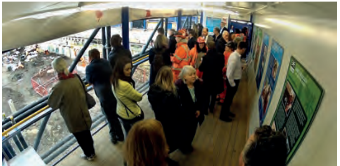
Visitors attending viewing gallery at Liverpool Street archaeology dig

media, marketing, and events teams to share archaeological findings with the public and to offer opportunities to experience archaeology first-hand. The highlights include: