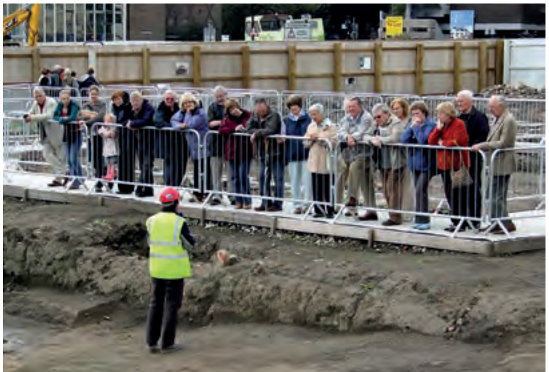
Hungate public site tour in progress