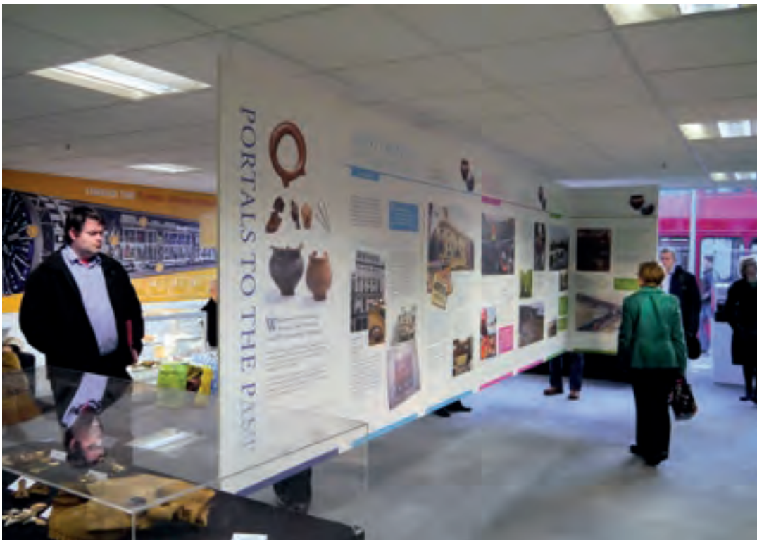
Portals to the Past exhibition

period and Portals to the Past in 2014 attracted more than 3,500 visitors.