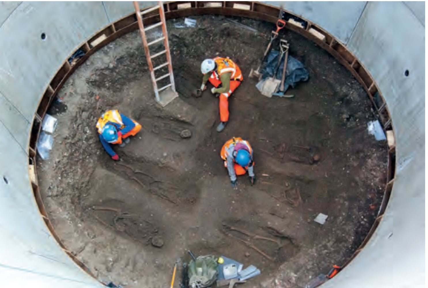
Farringdon, Charterhouse Square archaeology