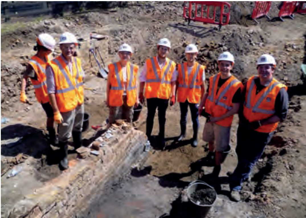
Stepney Green Community archaeology dig