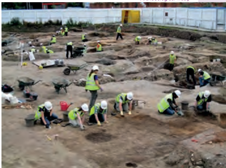
Archaeology trainees at work