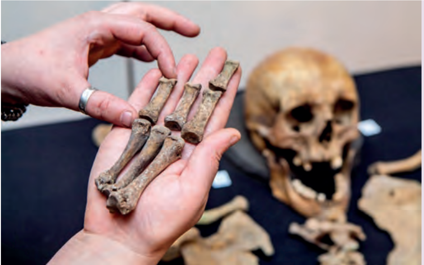
Bison to Bedlam exhibition