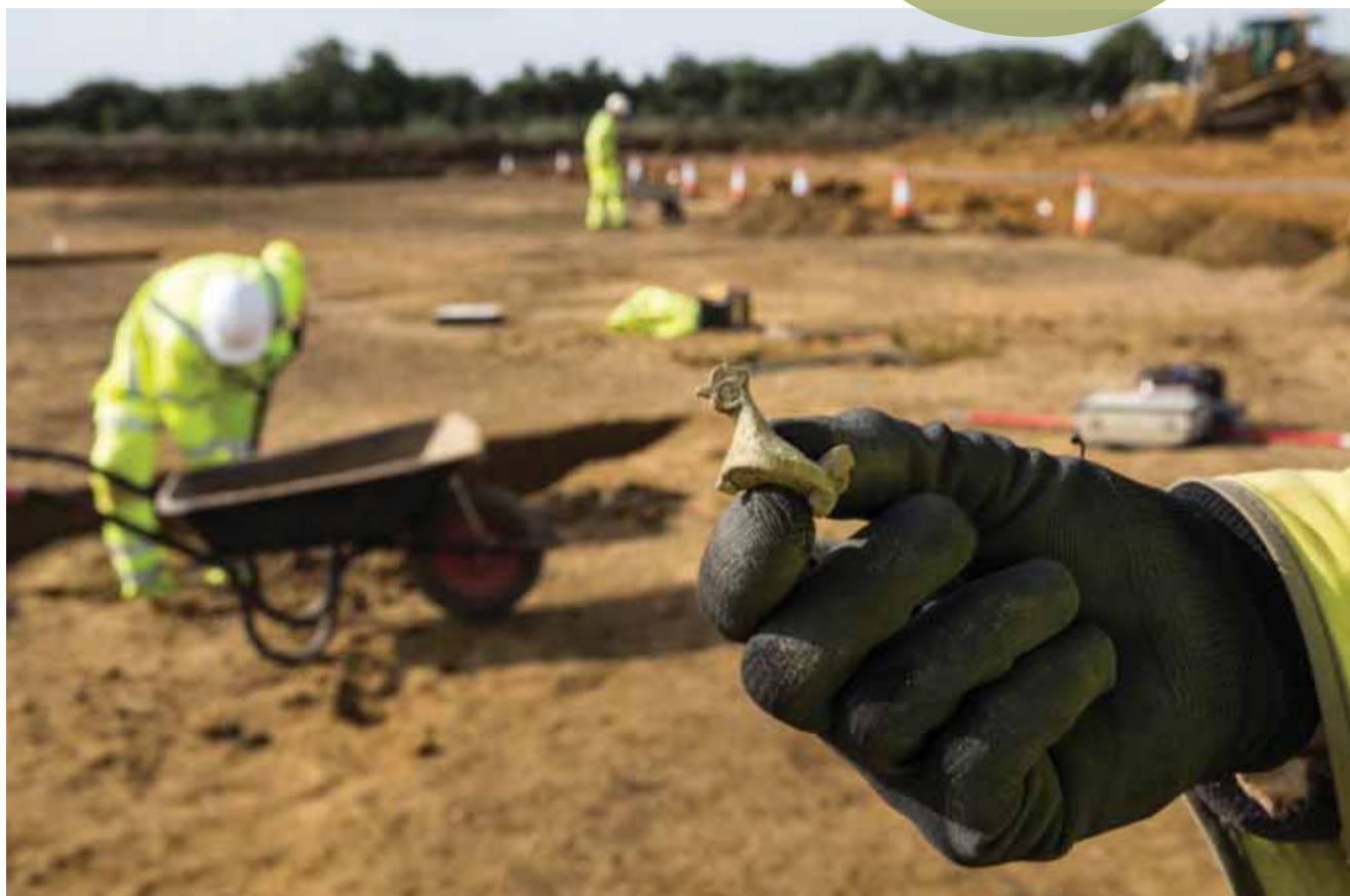
Roman chicken-shaped brooch.

Crucial to the professional and personal development of our EU colleagues is the protection of their status in the UK, that they know they are valued, and that we continue to learn from one another, whatever the result of Brexit might be.