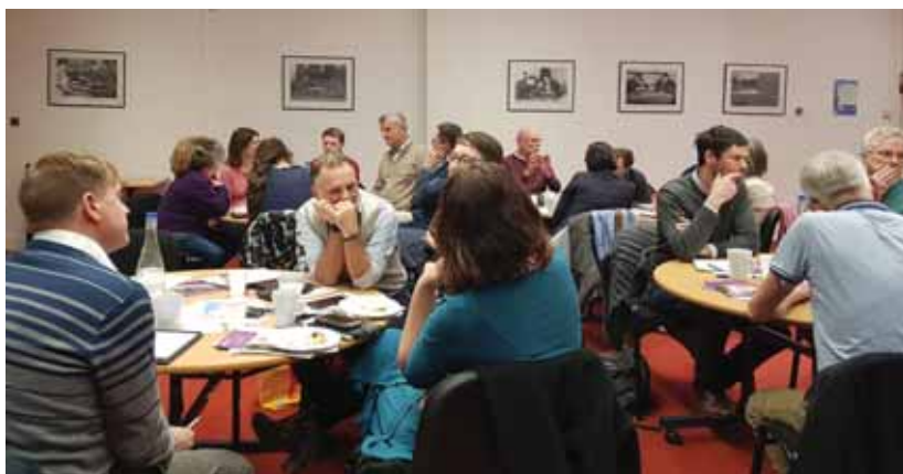
Advisory Council discussing the feedback from the committee participation survey.

If you'd like to know more about getting involved in ClfA committees and Groups, please contact admin@archaeologists.net