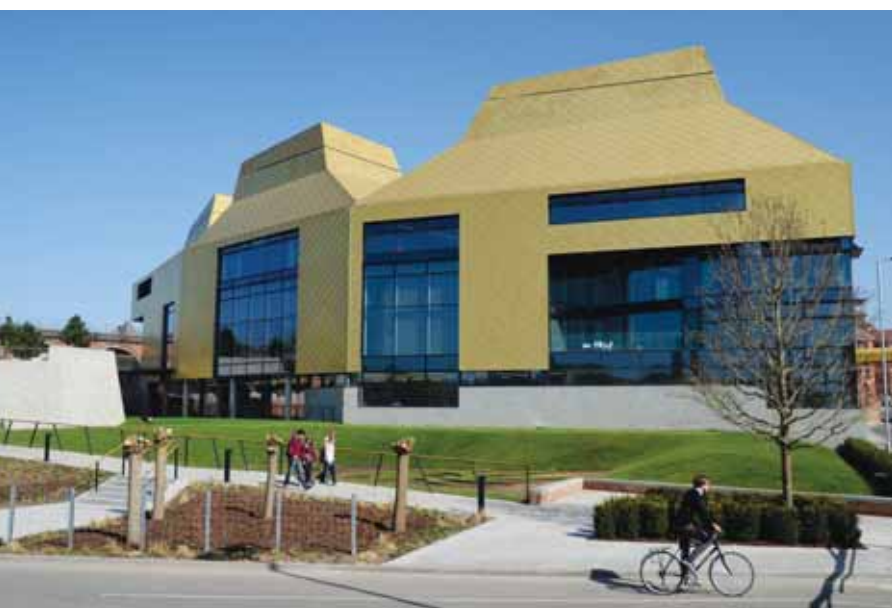
The Hive, Worcester.

More information about the project can be found at www.explorethepast.co.uk/project/Charles-Archive .