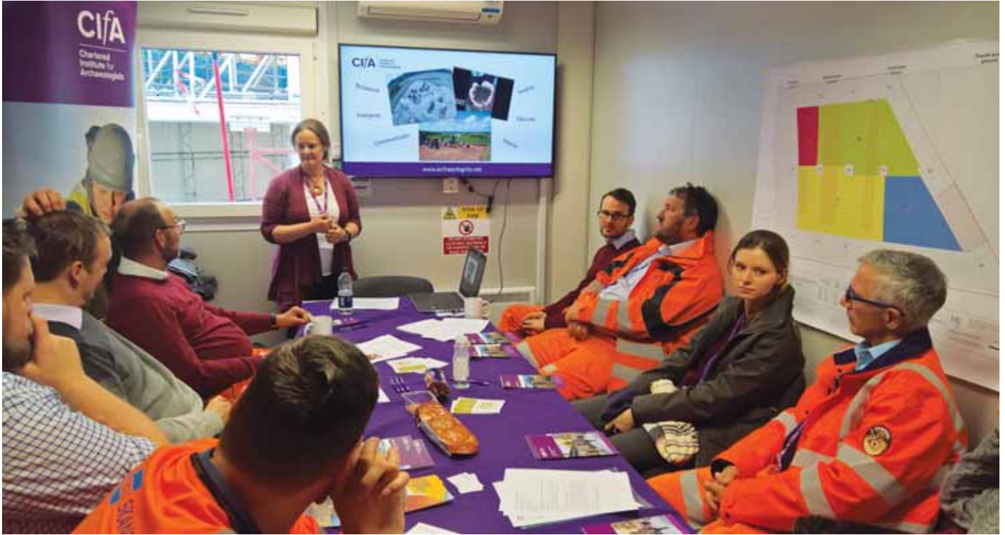
Talking to the construction team at HS2 Euston.