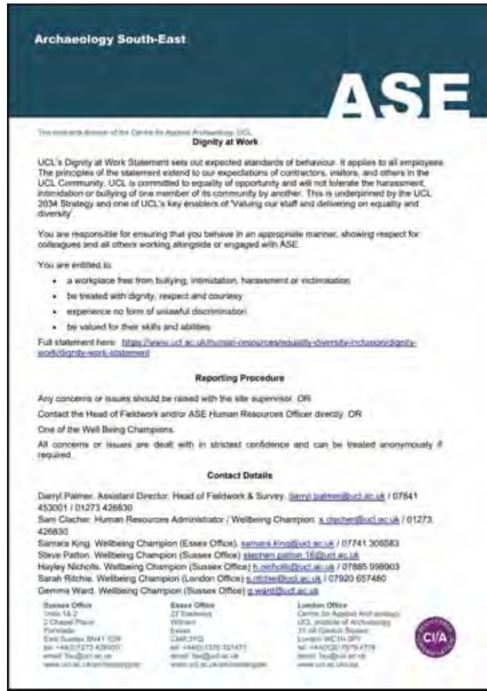
The infographic on display in all staff locations, including all welfare units in the field.

The Dignity at Work policy now forms a part of our Research and Method Statements (RAMS), meaning all clients and sub-contractors encountering our staff are required to read and adhere to the policy whilst working alongside our staff. Infographics created for use on site give staff contact details for the Wellbeing Champion of their choice.