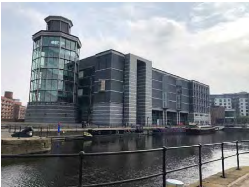
The Royal Armouries in Leeds was the venue for ClfA2019.