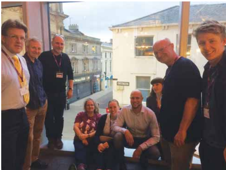
Albion Archaeology staff attending ClfA2019.