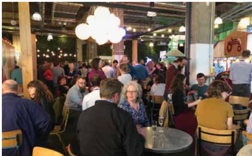
Events such as the ClfA annual conference can provide a wide range of networking opportunities.

Our website has a careers page with online training and a wealth of training and professional development information, as well as access to the online CPD diary where members have shared their CPD learning opportunities. Further training and resources can be found on the BAJR and CBA websites, and ClfA Area and Special Interest Groups regularly run CPD courses.