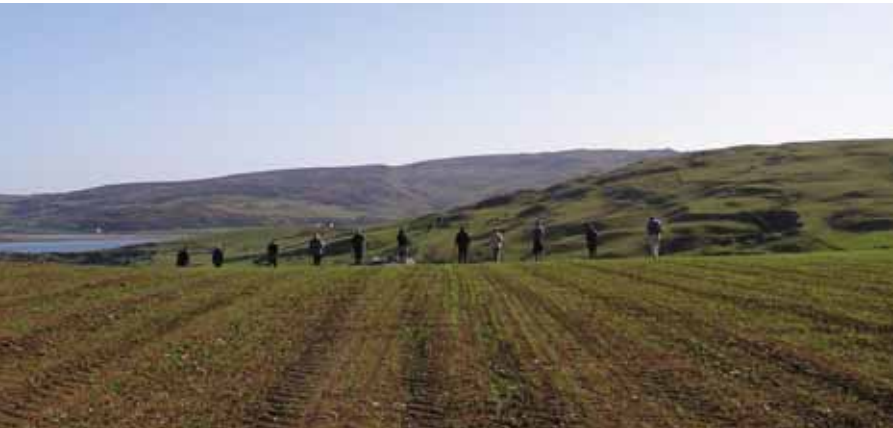
UCLan and UHI students excavating 19th-century whales at Cata Sand, Orkney.