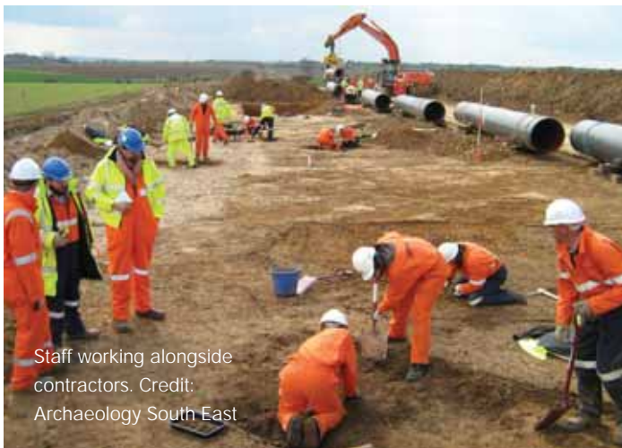
Staff working alongside contractors.

Last year Archaeology South East (ASE), part of UCL Institute of Archaeology, further increased the number of members of staff trained as first aiders via the British Red Cross scheme, thereby significantly increasing the number of physical first aiders on any given site. The reassurance of always having a first aider in proximity led me to wonder if it was possible to emulate the scenario with mental health first aid.