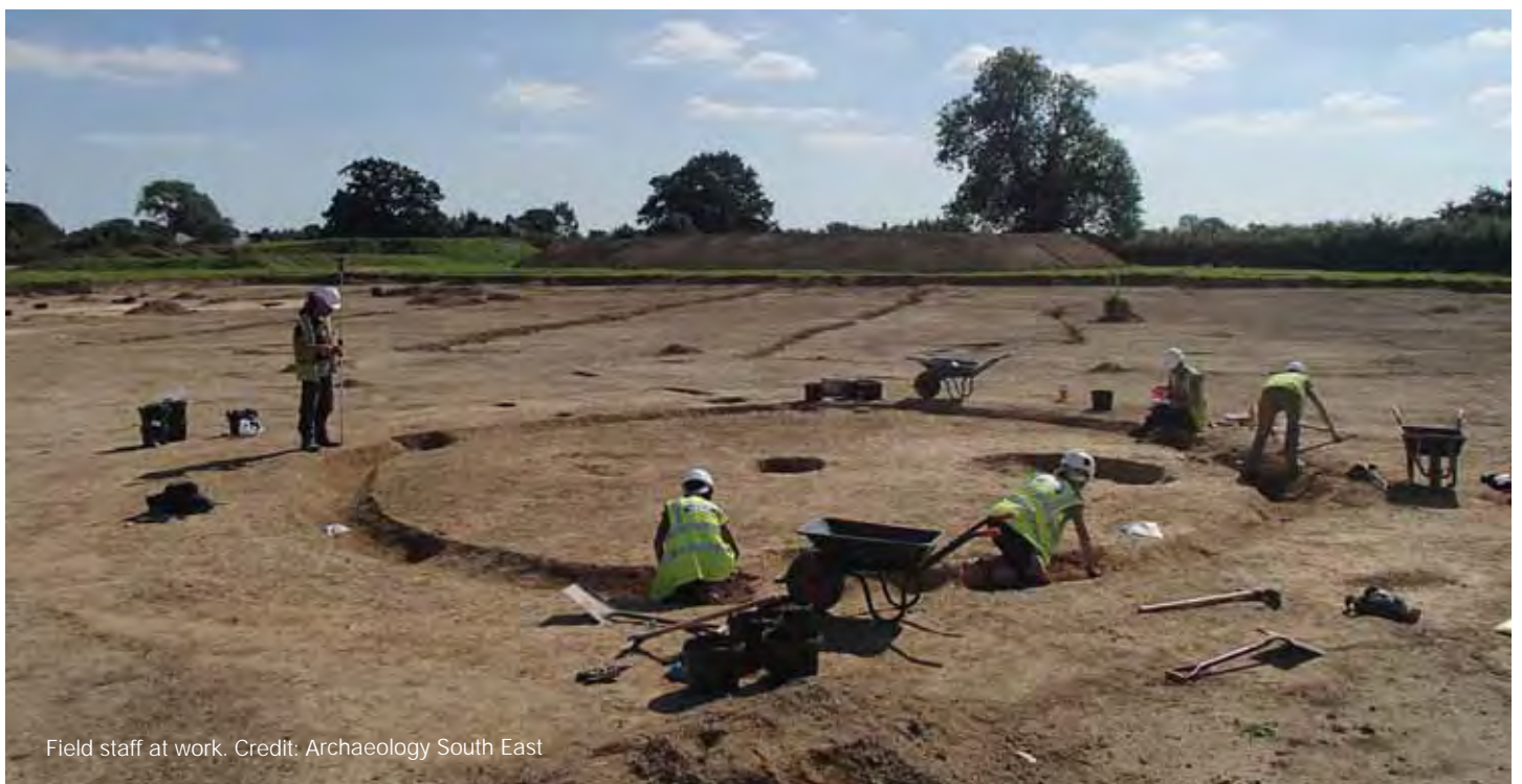
Field staff at work.

When I approached my management with this concept, they not only supported me in identifying mental health