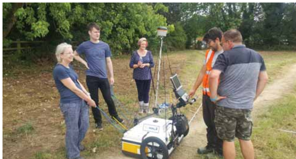
Surveying at a community project in Newport Pagnell.

Magnitude has a great teamwork ethic, employing around 20 people from diverse backgrounds. I feel I belong to a close-knit, supportive team, which is illustrated by our, and my, participation in the Bradford Dragon Boat Race Festival this coming June. I have found that in the time period I have worked for Magnitude I have been able to learn new skills in a working environment that encourages personal development and progression in a motivated, ambitious, results-driven company. Magnitude Surveys encouraged and supported my ClfA membership, paying for my subscription costs, and they believe in supporting the qualities of the individual – making the company and myself a success.