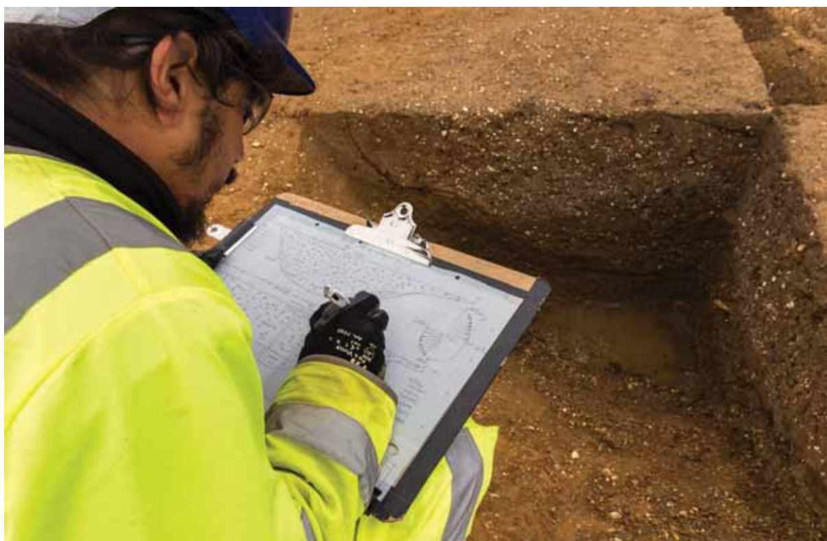
Archaeological recording on A14C2H.