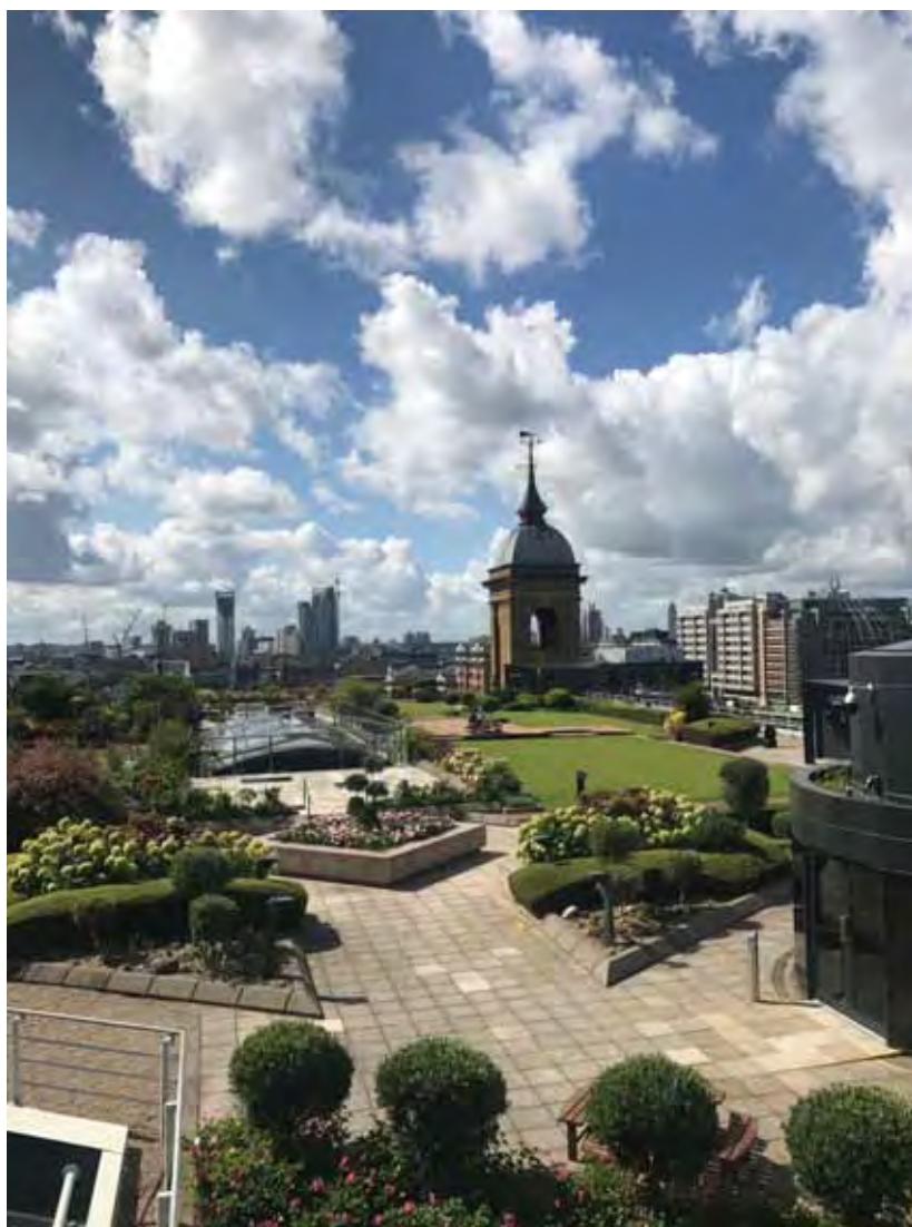
Cannon Bridge Roof Gardens.