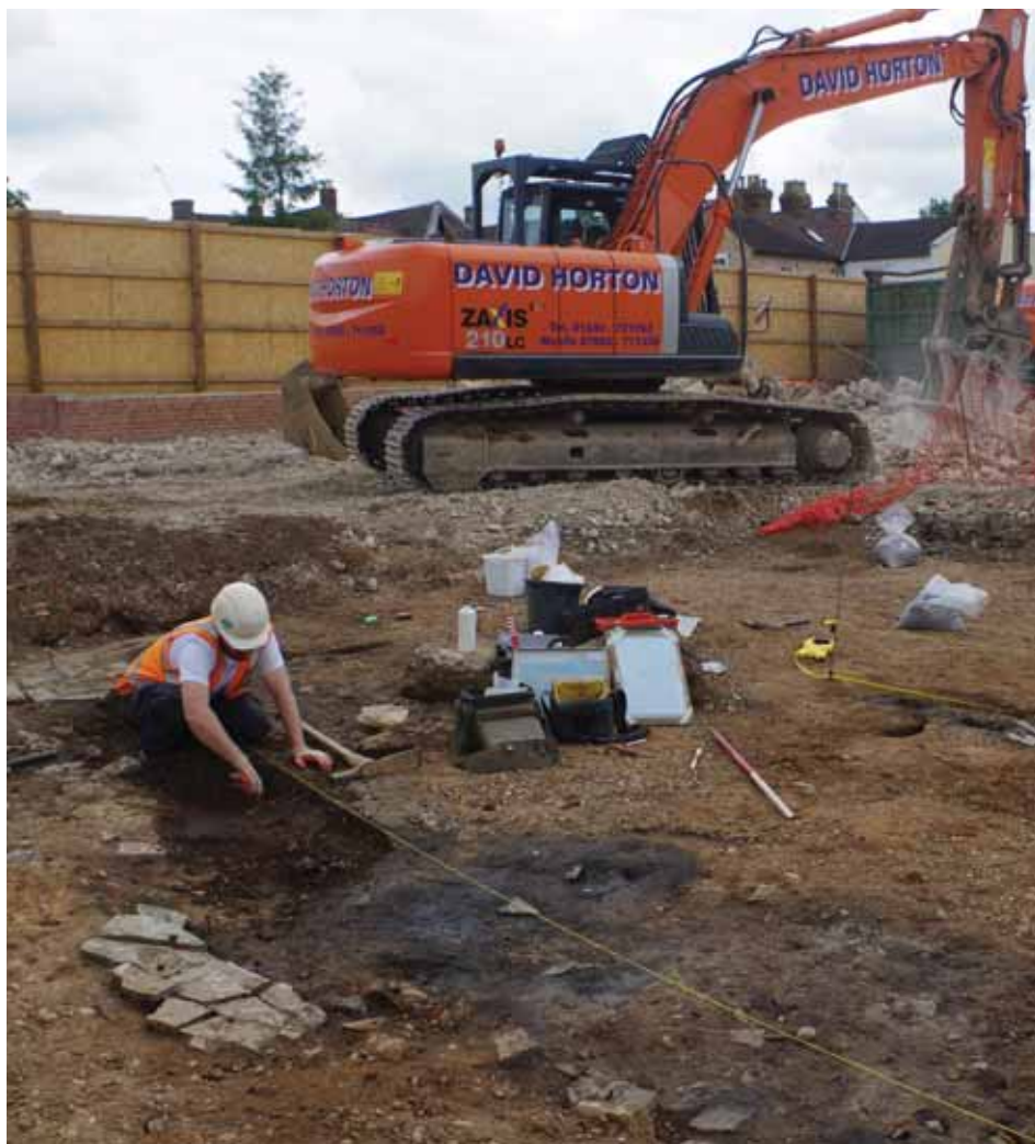
Excavating medieval ovens in Evesham.

So, my advice would be that for those of you being offered the opportunity to go to the conference, take it. It will almost certainly benefit you now, and in your future career.