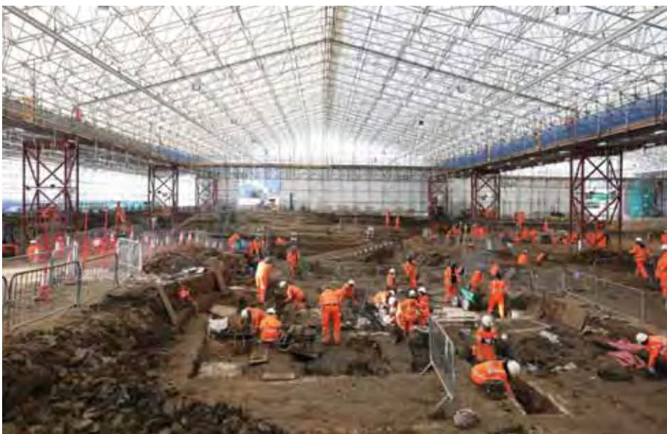
HS2 Ltd.

Feedback from the day was very positive and it was encouraging to see so many different disciplines turn up to meet the ClfA team and find out more about what ClfA has to offer – not only to the archaeological team but the construction industry as a whole.