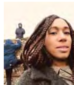
Family weekend walk at Silchester.

My line manager and team leader are particularly supportive of my equality and diversity work. We have feedback sessions, periodic personal development reviews and attend regular team meetings. At our team meetings we share our work, discuss our priorities as a team and talk about personal and team development. I think this makes a huge difference as we are supported to fulfil both our specific job requirements and to factor in personal development, which adds to job satisfaction.