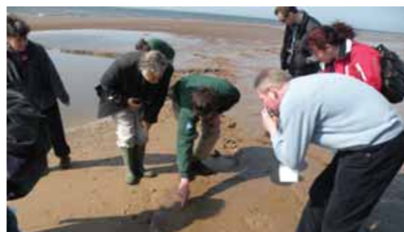
Footprints in the sand.