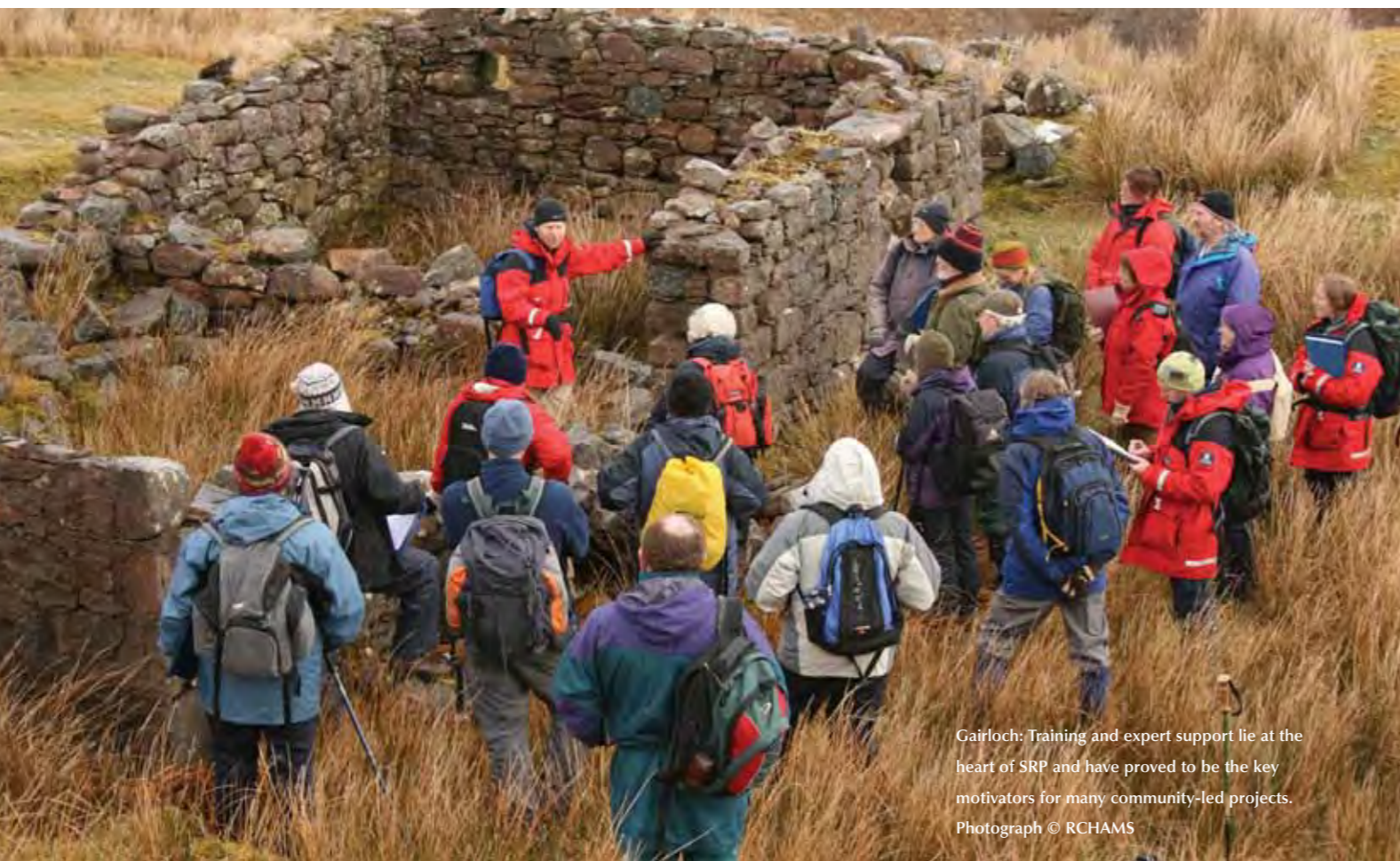
Gairloch: Training and expert support lie at the heart of SRP and have proved to be the key motivators for many community-led projects.