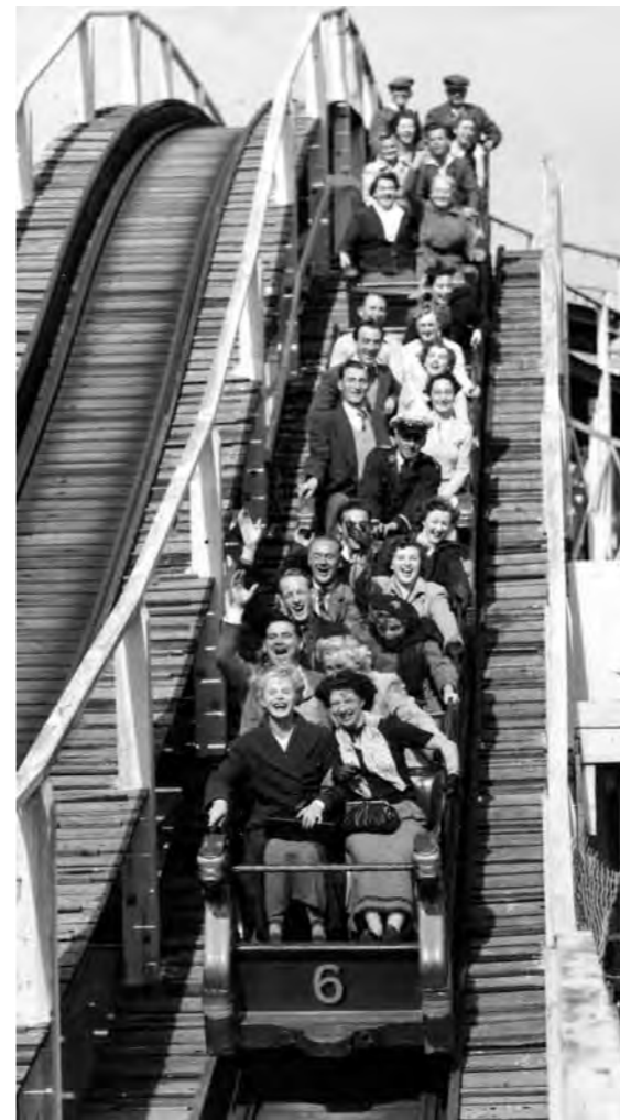
Scenic Railway rollercoaster