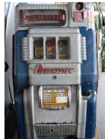
Part of Southport's past.