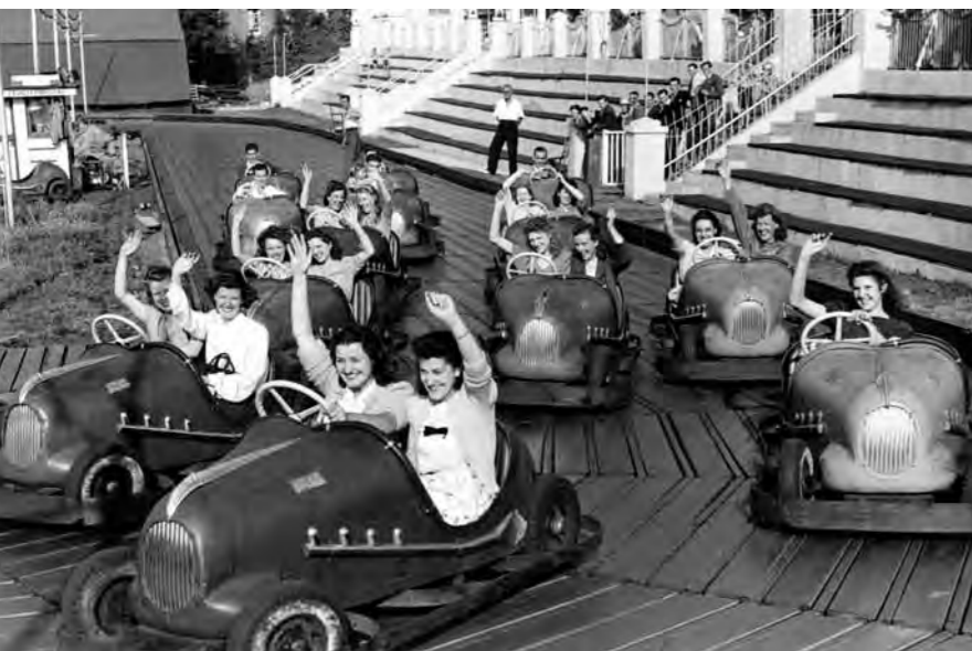
Brooklands Racers