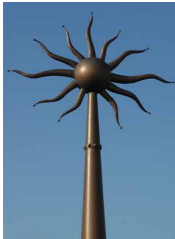
Southport sculpture.

Speakers emphasised the need for, and benefits of, structured skills training; and members of the audience highlighted the difficulties faced by early career archaeologists trying to develop their skills and build on their academic experience. There was a considerable amount of positive feedback regarding