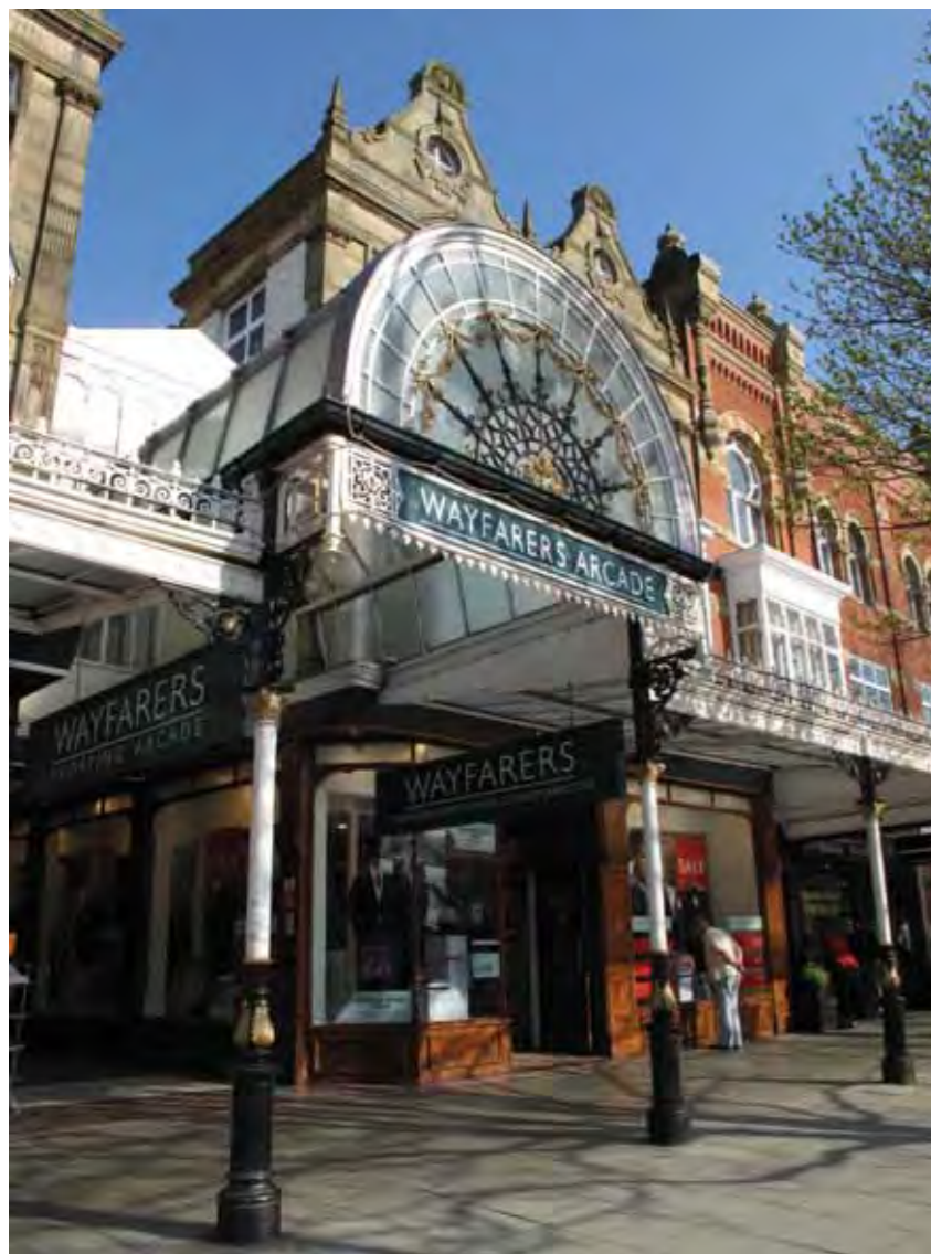
Southport's Wayfarers Arcade, which one of the tours visited.