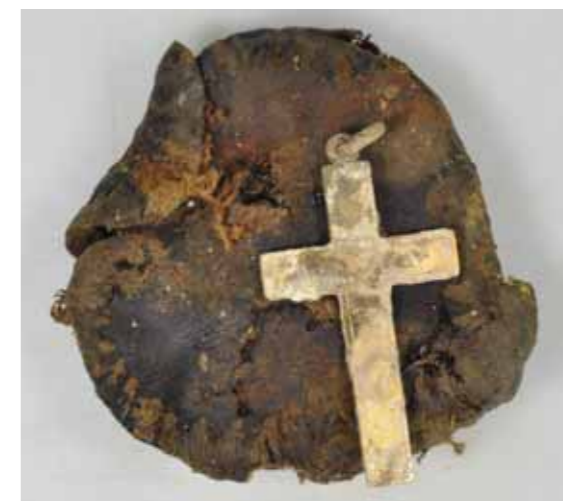
Symbol of love on death – a heart-shaped purse containing a lock of female hair and a gold cross, found with a soldier’s burial at Fromelles, Northern France