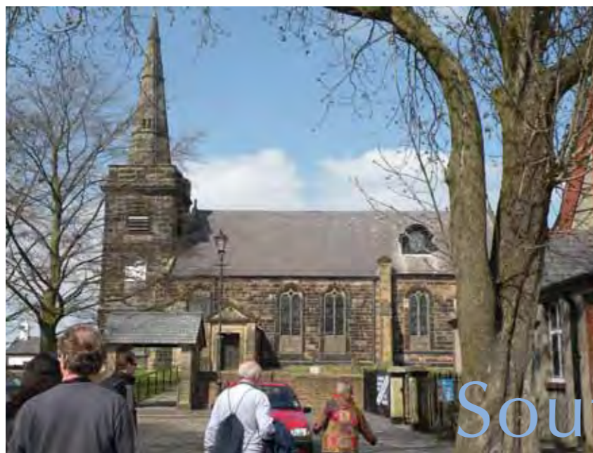
Delegates enjoying the tour of Churchtown.