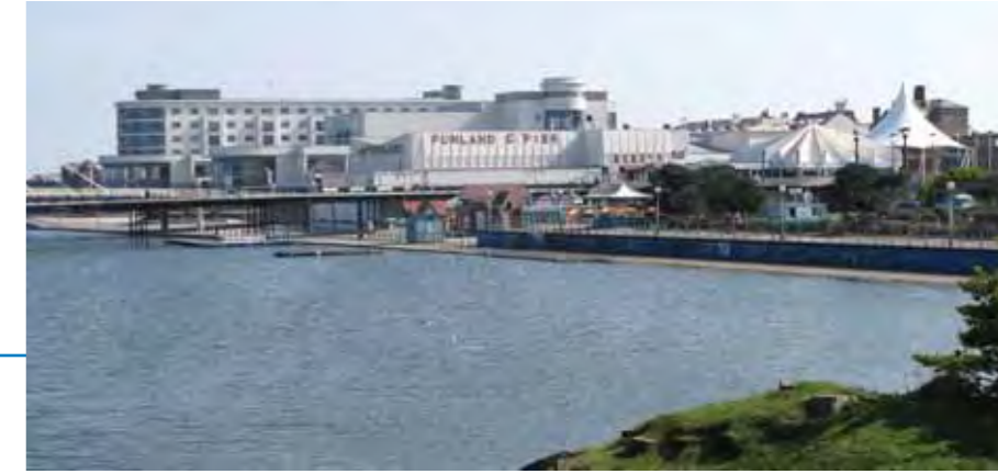
Southport's Funland.

The Festival of Britain, in 1951, was a controversial celebration of modernity and consumerism. It was the last event of its kind for some time. Battersea Park Funfair formed part of this exhibition and outlived it by two decades. The legacy of this prototype theme park, now partly forgotten, was