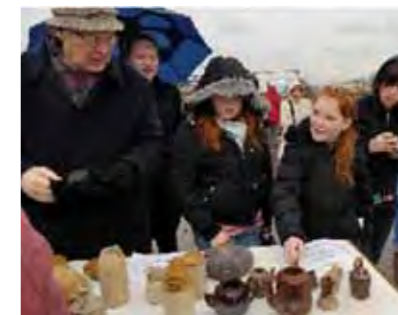
Caledonian Pottery Open day during the M74 Public Archaeology Programme in Glasgow.