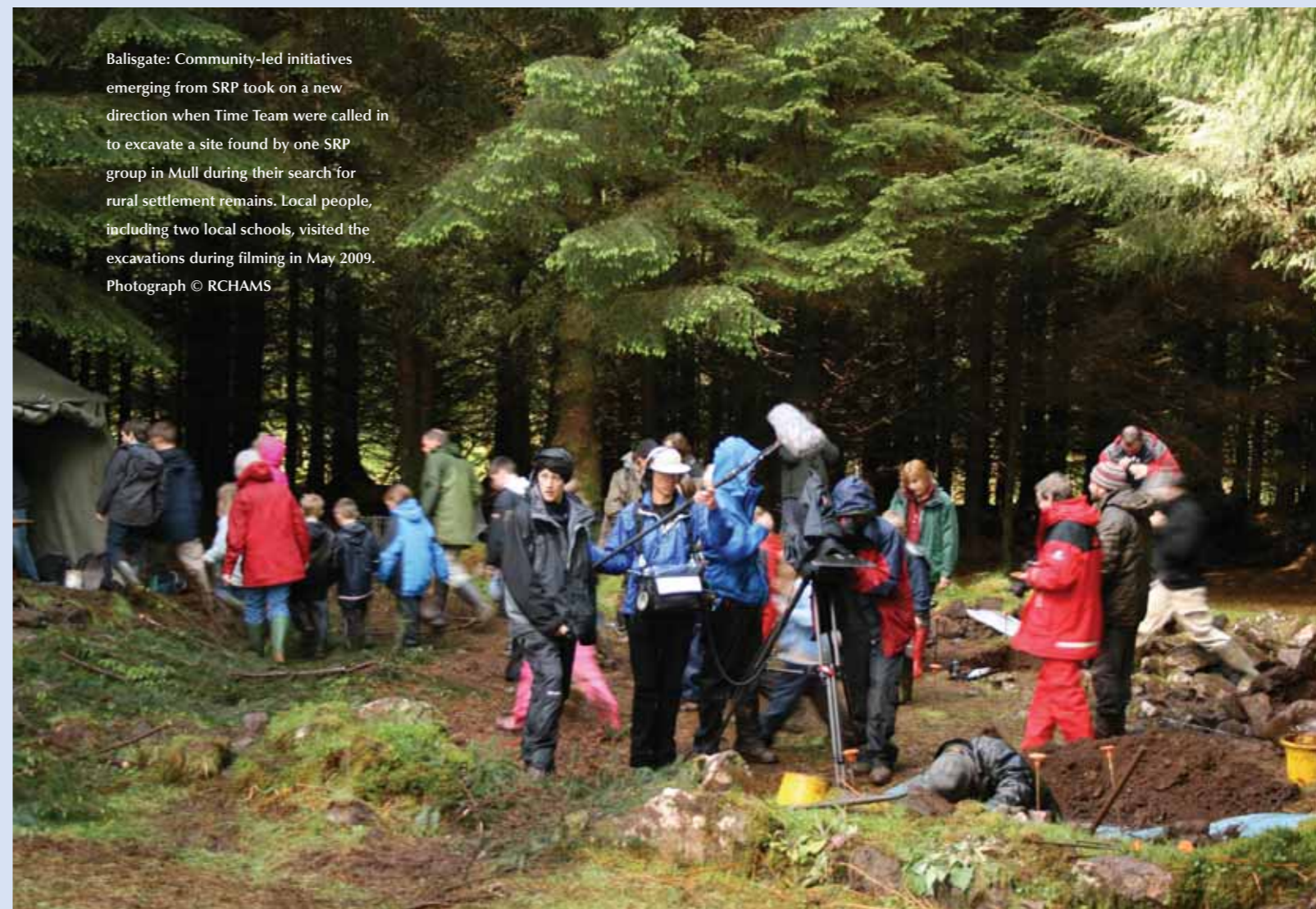
Balisgate: Community-led initiatives emerging from SRP took on a new direction when Time Team were called in to excavate a site found by one SRP group in Mull during their search for rural settlement remains. Local people, including two local schools, visited the excavations during filming in May 2009.