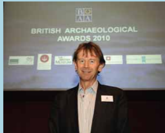
TV presenter Michael Wood at the British Archaeological Awards.

More information and full details of the winners can be seen on the CBA website ( www.britarch.ac.uk/news/100719-baa ). The Institute passes its congratulations on to all winners, in particular IfA Registered L-P Archaeology who designed the website for the Thames Discovery Programme ( www.thamesdiscovery.org/ ), winner of best representation of archaeology in the media.