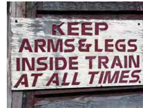
Scenic Railway rollercoaster warning sign (Jason Wood)