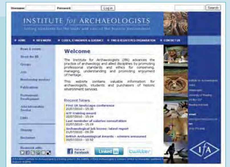
The new IfA website