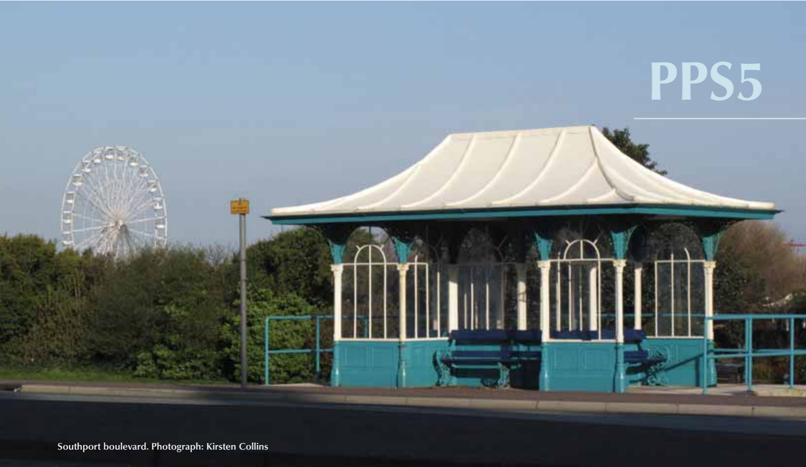
Southport boulevard.

PPS5 represents one of the most significant opportunities in decades for archaeologists, their client sector and the public to get more from archaeology. So agreed the delegates at the IfA conference in Southport in April 2010. In order to realise that opportunity, the conference recognised that the whole sector would have to think creatively and radically about how archaeology is practised and how the PPS may best be implemented. To take this forward a group was asked to reconvene to scope the potential, the aims and the means of achieving them. The group hopes to reach all parts of our multi-disciplinary sector, and is committed to promoting a broad and rapid debate across England, and, as far as planning policy permits, across the UK. It intends to stimulate contributions from the sector and beyond. It is proposed to issue frequent updates on the discussion, and produce a draft report for debate at the IfA conference in April 2011. This report will contain preliminary recommendations to heritage and property organisations, government and decision-makers on what is necessary to deliver the stated goals, as set out below. The group proposes to complete its report and wind itself up in July 2011.