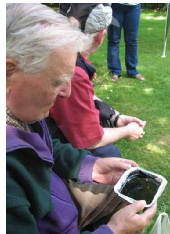
An experimental archaeology workshop organised by the Archaeological and Architectural Society of Durham and Northumberland.