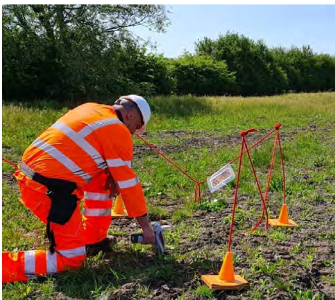
Figure 1 A geochemical sample being taken in the field using the portable XRF machine

A novel solution was identified to complete the evaluation of this site rapidly and under any weather conditions while keeping the works to timetable and budget. This comprised geochemical survey spaced on a 20m grid across the 7.8ha site with measurements taken using a portable XRF machine (Figure 1). This allowed the project to be completed to timetable whilst also producing a data set that could be compared with the evidence for buried archaeological remains as identified by the pre-existing geophysical survey. It is very unusual to use geochemical survey to undertake large-scale archaeological evaluation and even rarer for such an approach to be deployed in a commercial archaeological context. The results have been compelling, showing a clear correspondence between certain key elements including phosphorous, zinc, copper and potassium and the areas of archaeology as identified by the geophysics, and similarly low counts where the geophysics identified little or no archaeology (Figure 2).