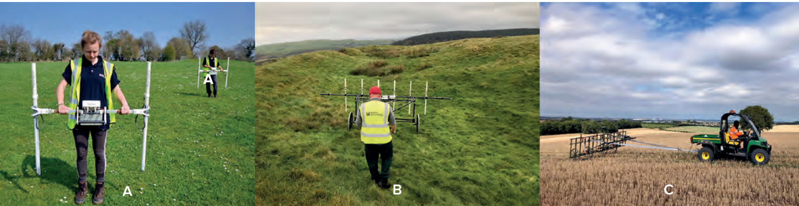
Typical gradiometer setups used in terrestrial geophysics: A) a handheld Bartington Grad601 dual sensor system; B) a non-magnetic cart mounted Bartington Grad-13 sensors; C) an all-terrain vehicle towed array with SenSys FGM650/3 sensors. In optimal conditions, handheld systems allow for approximately 2 ha of survey data to be collected in a single day, whereas cart-based systems and vehicle-towed systems can facilitate more than 5 ha and 10 ha respectively.

Registered Organisations are led by Members (MCIfAs) and have demonstrated their ability to act ethically and comply with professional standards, assuring clients that the work will meet their needs and be carried out in the public interest.