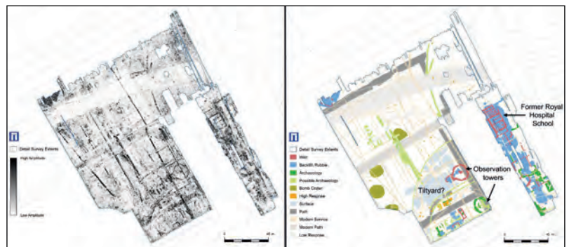
Greyscale plot and interpretation of multi-channel GPR survey from Queen Anne's house in Greenwich, illustrating the location of the observation towers of King Henry's tiltyard. Digital data reproduced from Ordnance Survey data.