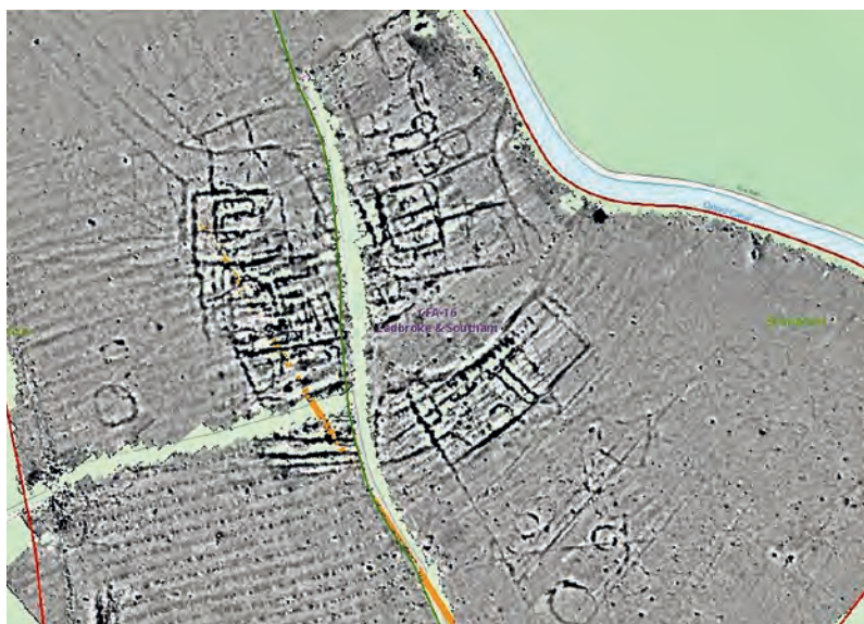
Geophysical survey results, Iron Age and Roman settlement

In support of the Hybrid Bill process and in advance of the Heritage Memorandum, the scheme was subject to an Environmental Impact Assessment. 3 This sought to establish the known heritage assets on the scheme and the potential impacts of the scheme design on those assets. 4 This assessment also included defining a series of archaeological character areas as a means of providing an overview of archaeological potential across different landscapes. Building on this work, with the initial 'urgent works' construction programme in mind, an archaeological risk model was developed. From a construction perspective, areas of higher risk were determined on the basis of locations where relatively little was known but where a set of criteria