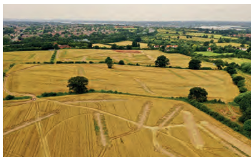
Approaches to evaluation and assessment for linear infrastructure

These case studies illustrate some of the evaluation techniques and approaches used to manage archaeology and reduce uncertainty, and we hope that they inspire those who are undertaking archaeological projects to seek advice and support from a ClfA-accredited professional.