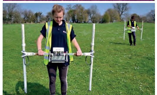
Placing geophysical survey at the centre of archaeological and heritage services