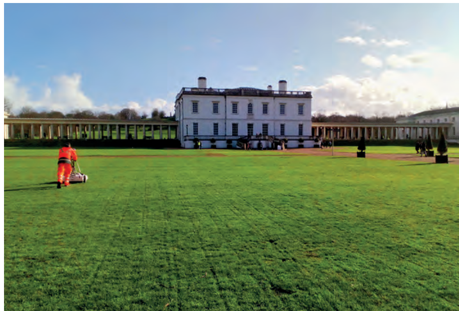
Multi-channel GPR survey in progress at Queen Anne's house in Greenwich, London (NHLE 1002060). The survey was undertaken using an Impulse Radar Raptor array, which contains eight transmitter and receiver antennae spaced 8cm apart, with a central frequency of 450 MHz.

The most widely used geophysical method in the UK is magnetic (fluxgate) gradiometer survey. This is because it responds well to the broadest range of archaeological features, is effective in most rural environments and can cover large areas quickly. Although results can be poor on some geologies and where there are extensive superficial deposits (for example alluvium), deeper geophysical methods, such as lower-frequency ground-penetrating radar (GPR), electrical resistivity tomography (ERT) and electromagnetic induction (EMI) can delineate landforms and subsurface variation, which in turn can be related to archaeological potential. The application of appropriate methods in different landscape settings can therefore be a powerful tool in managing the impact of developments on the historic environment.