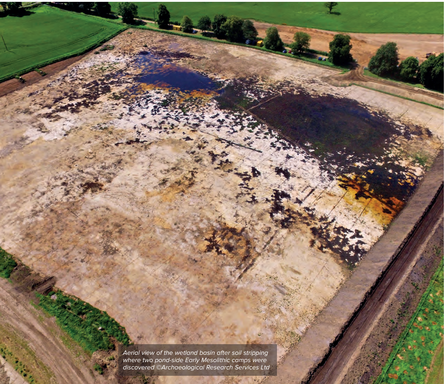
Aerial view of the wetland basin after soil stripping where two pond-side Early Mesolithic camps were discovered