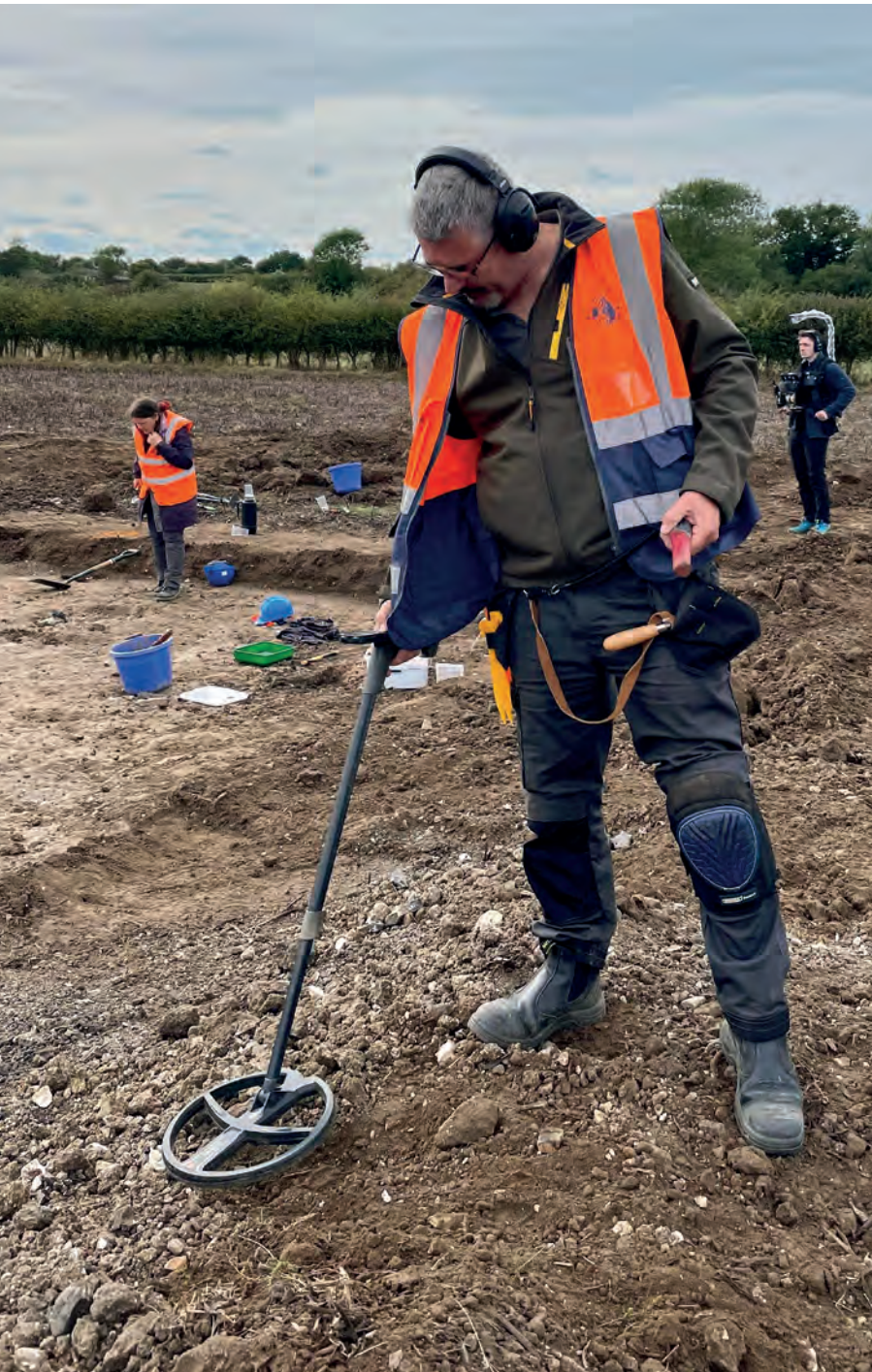
Using a metal detector to pinpoint targets for investigation on an archaeological site

post-excavation, the resultant archive of portable heritage. However, is there a wider value beyond the information gained from artefacts? Could adopting DAPAS bring a commercially viable and consistent approach to learning from and saving our portable heritage?