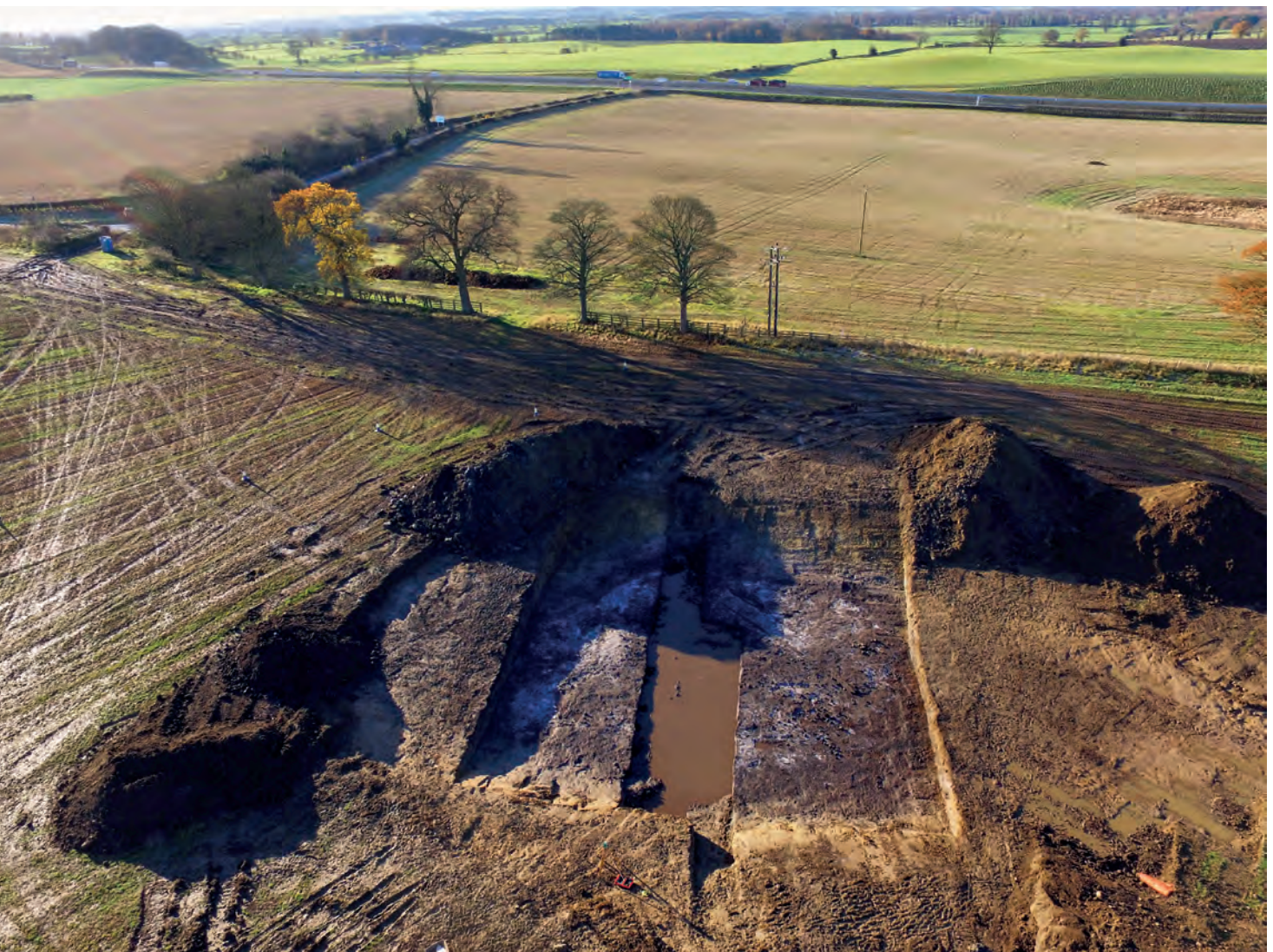
Aerial view of excavations following initial stripping and sampling works on one of the kettle holes

on from these studies we conducted targeted geophysical survey and evaluation trenching. Once this site received planning permission, we undertook archaeological recording, analysis and dissemination of the results, based on a scalable watching brief or strip, map and sample planning condition, together with the targeted sample excavation of specific floodplain features.