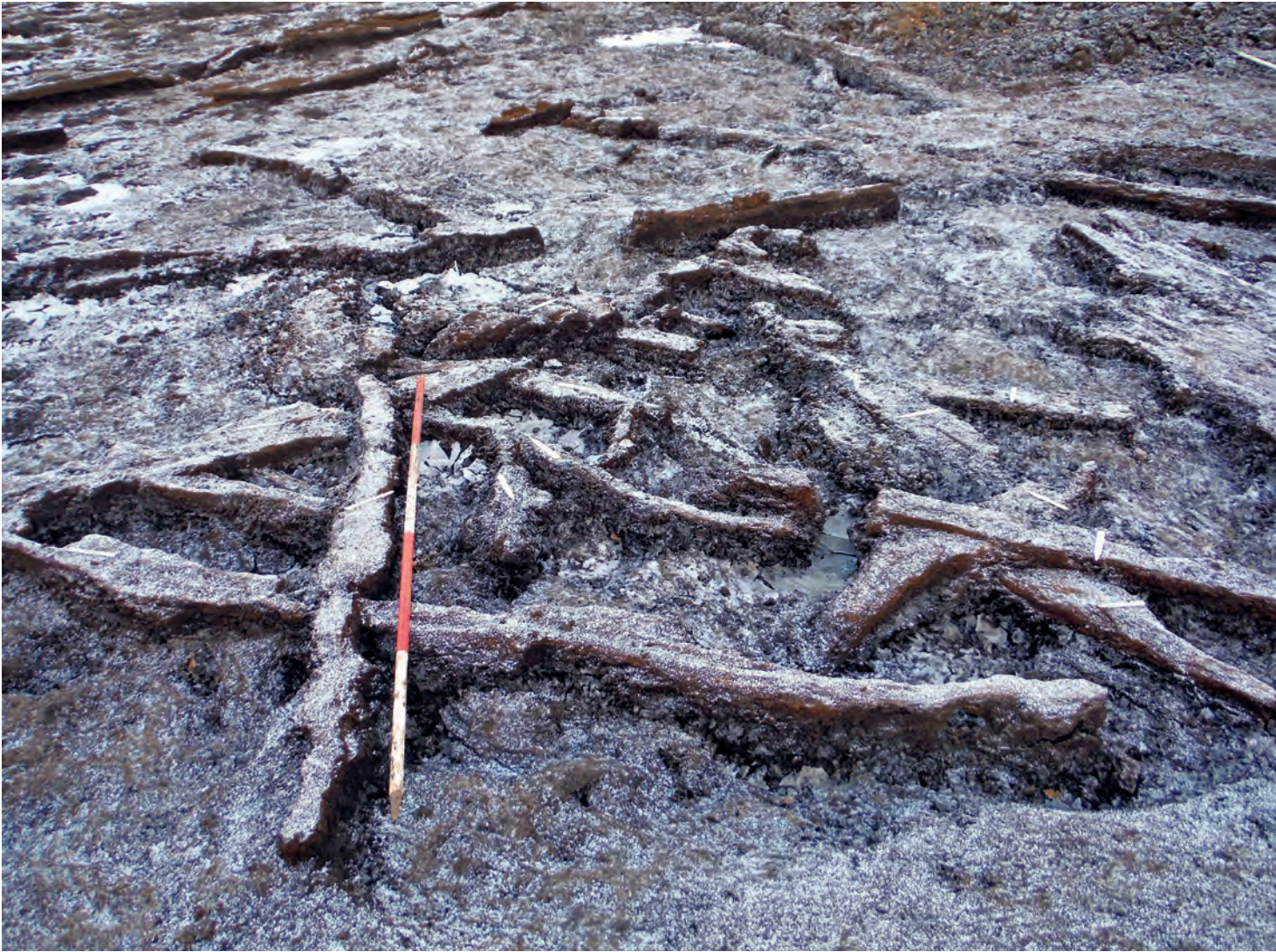
View across the Late Mesolithic timber platform, built out into the kettle hole pond where chipped flints and timber posts were found