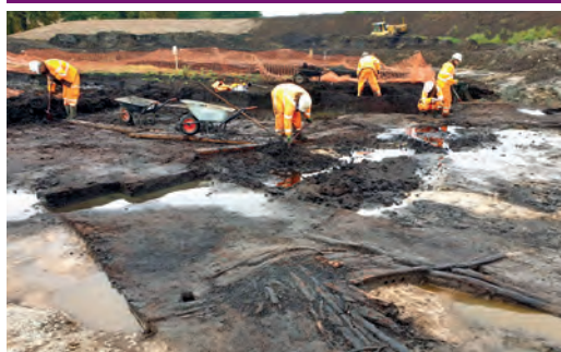
A geospatial approach to evaluating large land parcels