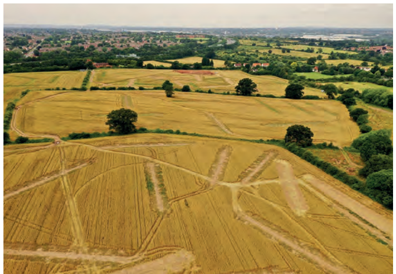
Targeted trial trenching as part of the HS2 historic environment works

In conclusion, the historic environment works for HS2 Phase One demonstrate that having a robust and well-considered understanding, both of known heritage assets and an assessment of the potential for unknown archaeology, can help determine a suitable evaluation strategy that will help to identify and define any archaeological deposits on a site and reduce the risk of unexpected discoveries. The approach can be tailored to the type of archaeology that the preceding assessment and non-intrusive work has considered most likely to be present or which specific research objectives have been highlighted as a priority for investigation. This approach to evaluation can help to define targeted mitigation strategies which are suited to the archaeological aims of the investigation.