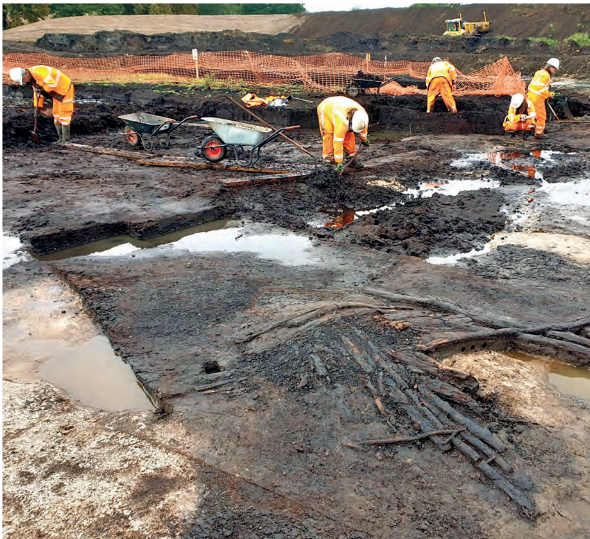
Excavation of one of the Early Mesolithic tepee-type structures with the hearth and the remains of its last fire visible in the foreground

Finding rapid, cost-effective ways to evaluate large land parcels for archaeological and palaeoenvironmental remains has always been a challenge for developers and archaeologists. Archaeologists acting for developers have used various techniques over the years to evaluate sites in advance of development, with some, such as aerial photograph transcription, general remote sensing and geophysical surveys, making huge contributions to the number and location of new sites. For those areas where there is little pre-existing remote sensing data or which have geologies, soils or ground conditions unfavourable to crop or soil mark formation, and/or which have restricted scope for geophysical survey, other approaches for evaluation of these areas need to be found.