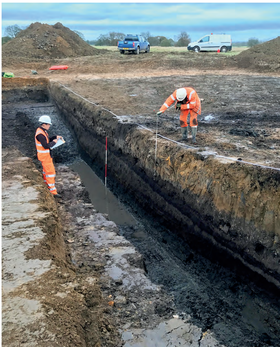
Recording a well preserved sediment stack within the kettle hole containing the Late Mesolithic timber platform. A detailed and highly informative paleoenvironmental record from the Late Glacial through to the mid-Holocene was retrieved.

along with finds of cattle teeth, chipped flints and a stone rubbing tool, as well as posts, postholes and other features. We have interpreted this as a platform for processing animal skins and potentially curing hides in the pond. This site also had successive occupation in the Neolithic and Bronze Age, stratified above the Mesolithic remains. In both cases these well-preserved archaeological remains also had preserved alongside them a continuous palaeoenvironmental sequence of deposits that can tell us about landscape development and human activity in the immediate surrounding landscape.