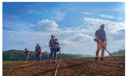
Metal detecting as an evaluation technique