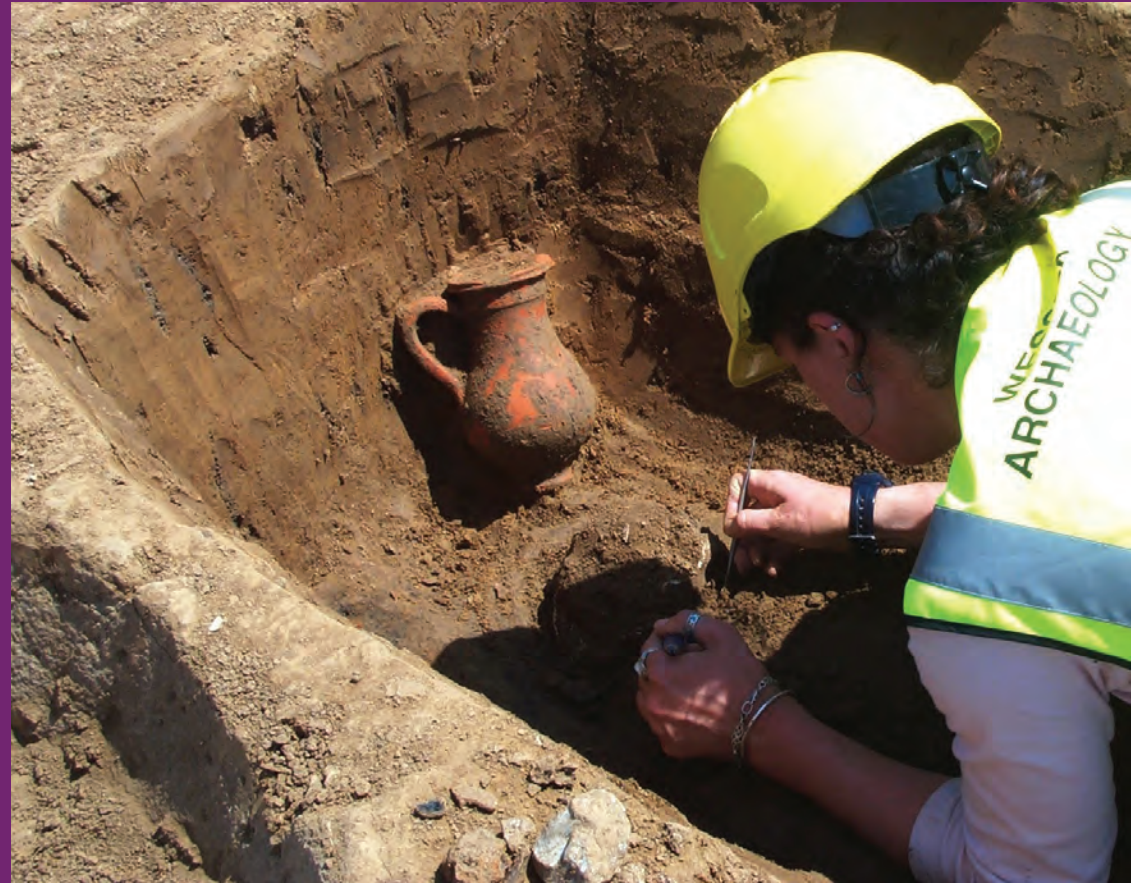
Cover image: © Messex Archaeology