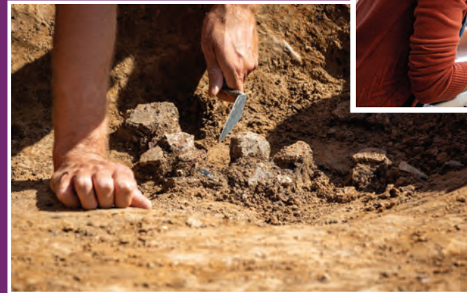
Front cover images: © Wessex Archaeology