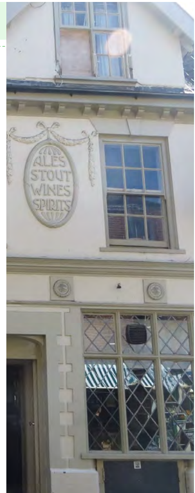
The Plough Inn, Norwich

The BAG newsletter has already given a preview of the results of the Survey Monkey questionnaire, which 80 members answered. The online data has been supplemented by some anonymised statistics about the membership as a whole and analysis of the results is underway. The committee are trying to weigh up the (sometimes conflicting) desires for venues closer to transport links, to target the areas of greatest membership, CPD for both early career and more specialised needs, and co-hosting events with other CifA Groups and non-CifA organisations. Any further suggestions from the membership are warmly welcomed.