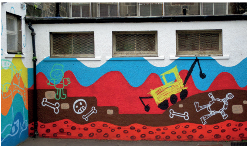
Victoria Primary School, Newhaven – mural painted by the children to celebrate the 2015 discovery by AOC Archaeology Ltd of the 'Newhaven Pirate'