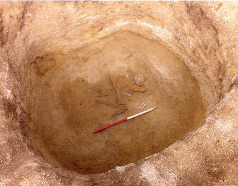
Figure 5: The primary burial at skate park barrow, Lechlade