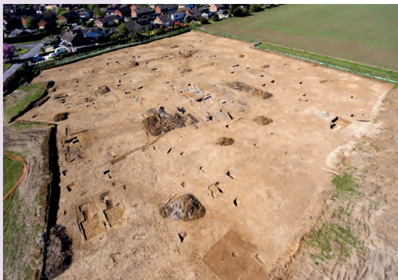
Figure 1: Cholsey phase 1 excavations

ANDREW HOOD MCIFA, FOUNDATIONS ARCHAEOLOGY