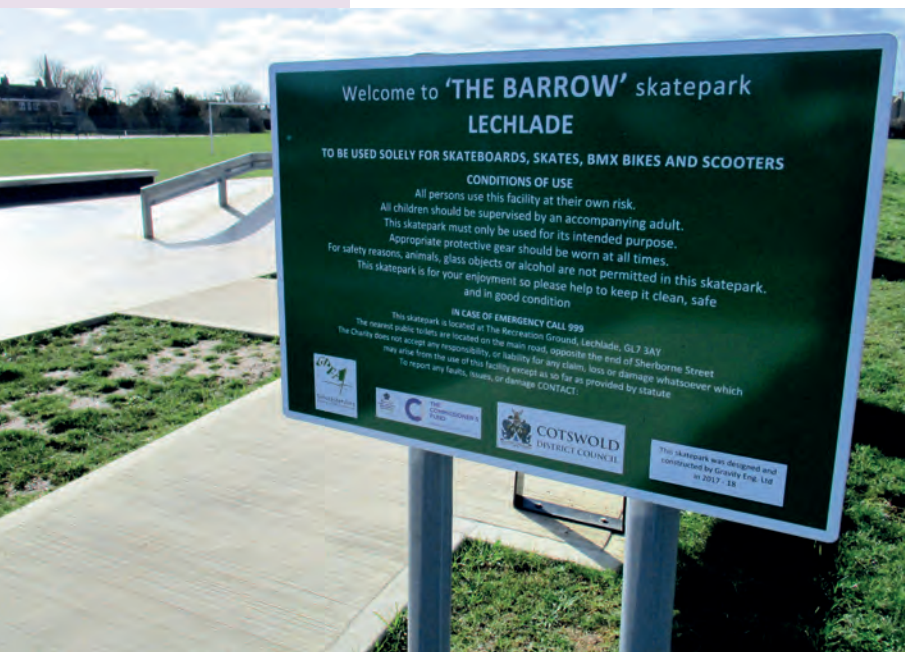
Figure 6: The Barrow skate park

on BBC Radio Gloucestershire. As with the Cholsey site, it was clear that people were very interested, not only in the barrow, but also in the process of excavation. People of all ages, genders and backgrounds would frequently come to site for updates and discussions. The positive interaction between the archaeologists and the public was key to success here.