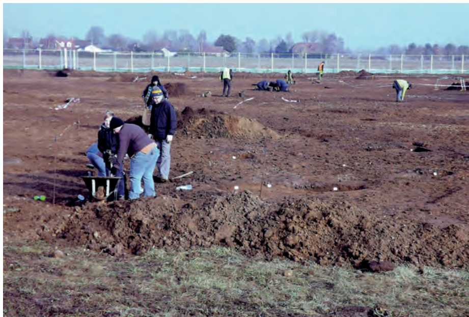
Figure 2: Members of The Wallingford Historical and Archaeological Society (TWHAS) excavating at Cholsey

In light of these parameters, the area around the villa was designated 'an area of play' within the development plan and was not subject to below-ground disturbance. Moreover, the area was 'mounded-up' with topsoil in order to create sufficient overburden to hinder metal detectorists. Subsequent to the completion of the housing development, a permanent