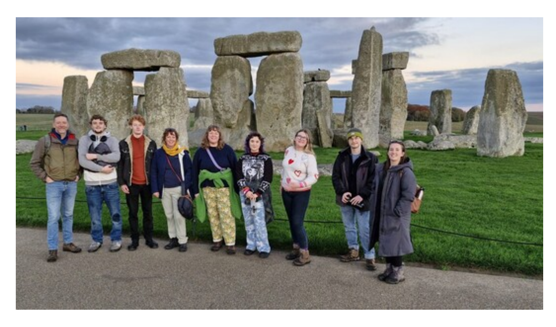
Archaeological technician apprentices' field trip

Survey data will be collected and stored in line with our <u>GDPR policy</u> Get in touch with any questions at <u>approvedcpd@archaeologists.net</u>