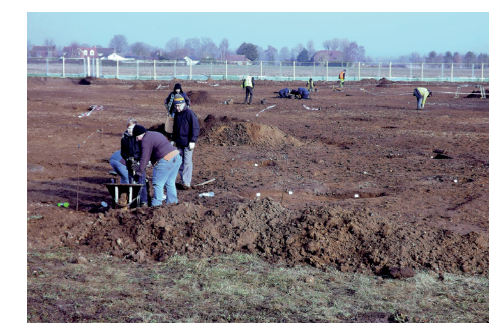
Figure 2: Members of The Wallingford Historical and Archaeological Society (TWHAS) excavating at Cholsey

Foundations Archaeology has been conducting archaeological fieldwork throughout Britain for over 20 years, evolving from a small to a midsized archaeological contractor during that time. We have recently undertaken two projects which are particularly relevant to the issues raised above.