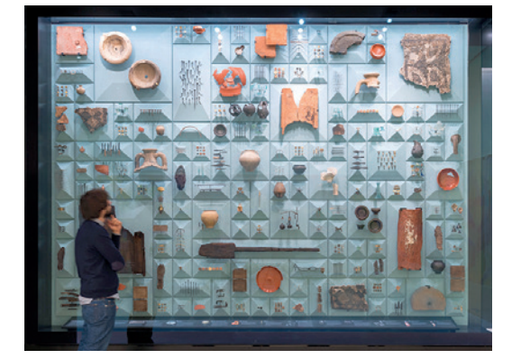
Six hundred of the 14,000 Roman artefacts uncovered on the Bloomberg site are displayed on the ground level of London Mithraeum Bloomberg SPACE.