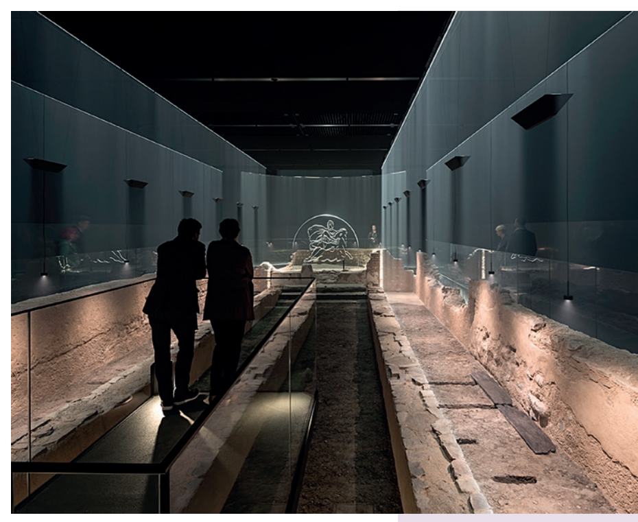
London Mithraeum uses light sculpture, haze and sound to bring the temple's remains to life.

As part of our commitment to making the Mithraeum and the collection as accessible as possible we have produced three publications and we run a dynamic events and education programme developed in partnership with the Museum of London.