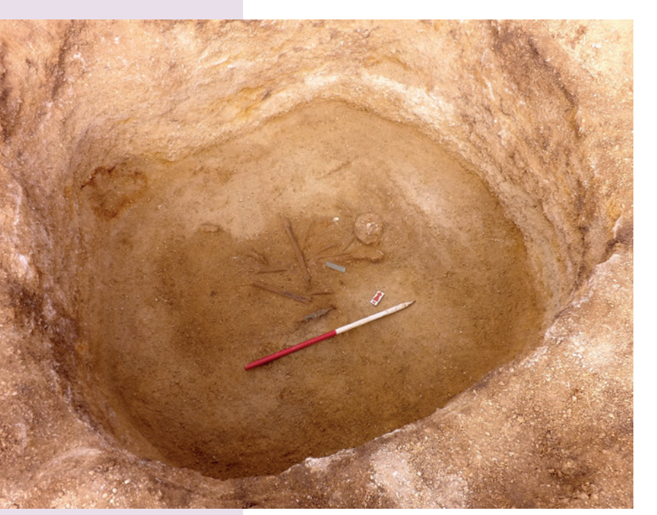
Figure 5: The primary burial at skate park barrow, Lechlade