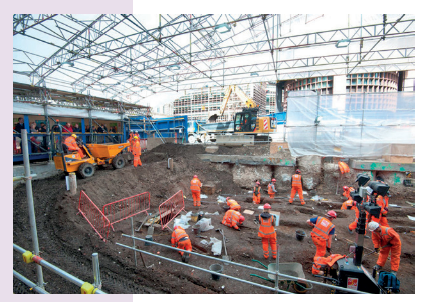
Lunchtime crowds attend the excavations at the Bedlam (Bethlem) burial ground (Photo: Jay Carver)

Open day at Westbourne Park (Photo: Jay Carver)