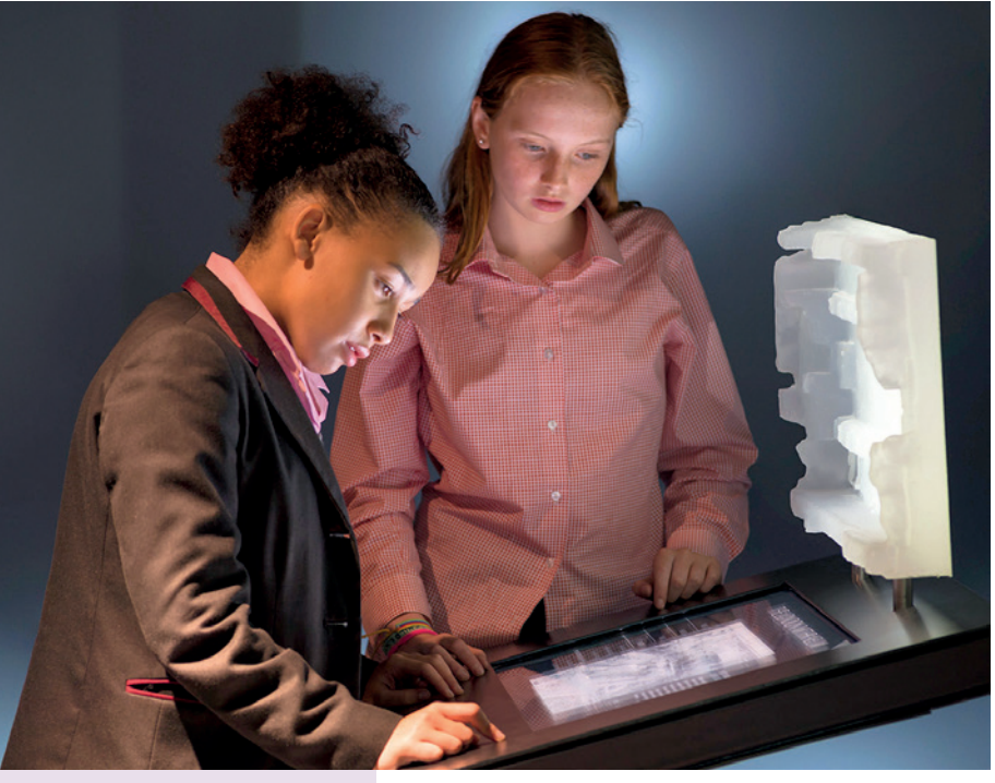
Interactive kiosks invite visitors to learn more about the rituals and beliefs behind the cult of Mithras.