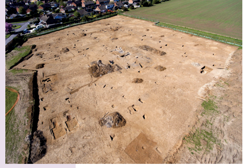
Figure 1: Cholsey phase 1 excavations

ANDREW HOOD MCIFA, FOUNDATIONS ARCHAEOLOGY