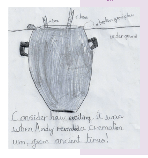
Figure 4: Herb's (aged 9) picture of a plough-damaged cremation (Photo: Herb/Foundations Archaeology)

Figure 3: Kids and corndryers (Photo: Foundations Archaeology)