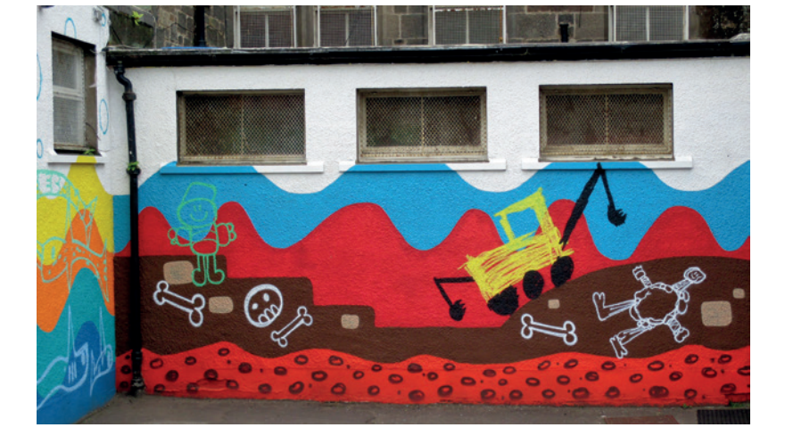
Victoria Primary School, Newhaven – mural painted by the children to celebrate the 2015 discovery by AOC Archaeology Ltd of the 'Newhaven Pirate'

Aberdeen Western Peripheral Route – free booklet for the public explaining what was found, and how it was found, during the construction of the bypass